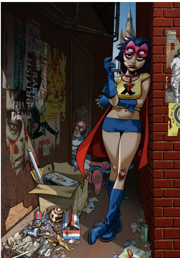
Jamie Hewlett design for Comics Unmasked at the British Library © Jamie Hewlett 2014.

Keywords: British Library; libraries; comics; comic books; UK; Comics Unmasked; exhibition; art