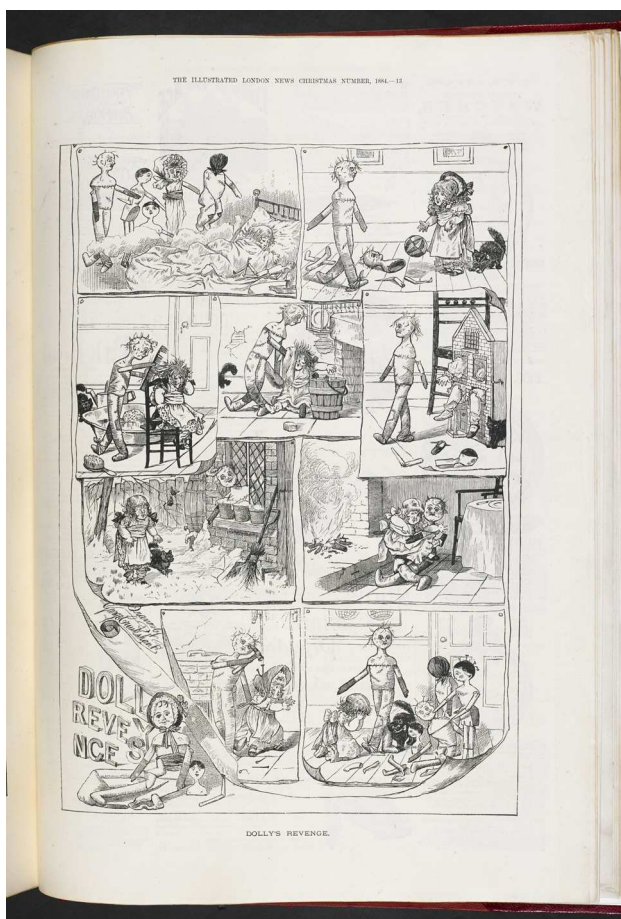
"Dolly's Revenge". The Illustrated London News .

AE: There's some fascinating stuff. There's so many things that are exciting about this, but some of the 19th century comics that we found, such as the ones in The Graphic and The Illustrated London News , you actually have places where, in the Christmas issues, members of the public could write in and send sketches of things, stories that happened to them. And the in-house artists would draw them up as comics. You actually get, from the 1880's, a glimpse of what a young woman on a ship going across the Atlantic felt about being pursued by various gentlemen, because she expressed this in these