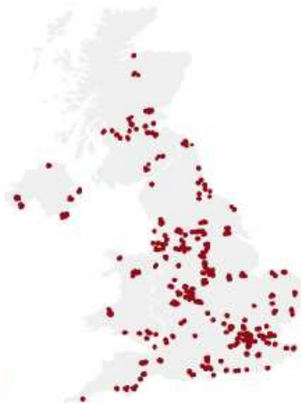
Figure 1: UK addresses sampled to participate in ESS Round 6 (2012/13)

The European Social Survey is an academically driven survey of public attitudes and opinions conducted in more than 20 European countries every two years since 2001 ( www.europeansocialsurvey.org ). For this analysis we use Round 6 of the survey conducted in 2012/13 and focus on the UK. The ESS sample in the UK consists of 4,520 addresses sampled from the Postcode Address File to provide a nationally representative sample. Interviewers then make a random selection from amongst the household members on the doorstep. In common with most face to face surveys conducted in the UK, the ESS sample points are highly geographically clustered into 220 Primary Sampling Units (based around postcode sectors) to make fieldwork more resource efficient. The implications of this geographic clustering for our analysis will be discussed.