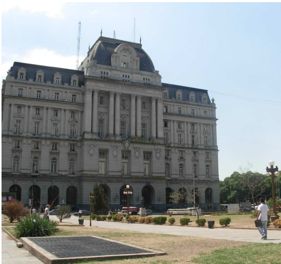
Fig. 1. The Palacio de Correos y Telecomunicaciones, prior to refurbishment.

classical music venue – was considered higher than that of an under-used factory.