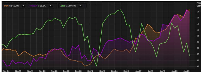
Figure 3: TTWO (purple) & FUN (orange) were picked and increased in price – even surpassing the S&P 500 index (green).

In the broader context, stock prices in the two companies specifically selected by participants as being of investment interest in the final evaluation subsequently increased (see Fig. 3). Most notably, the developer’s subsequent employment as a Data Visualization Specialist for the F & R Design team at Thomson Reuters is indicative of the level of success felt by the industrial partner.