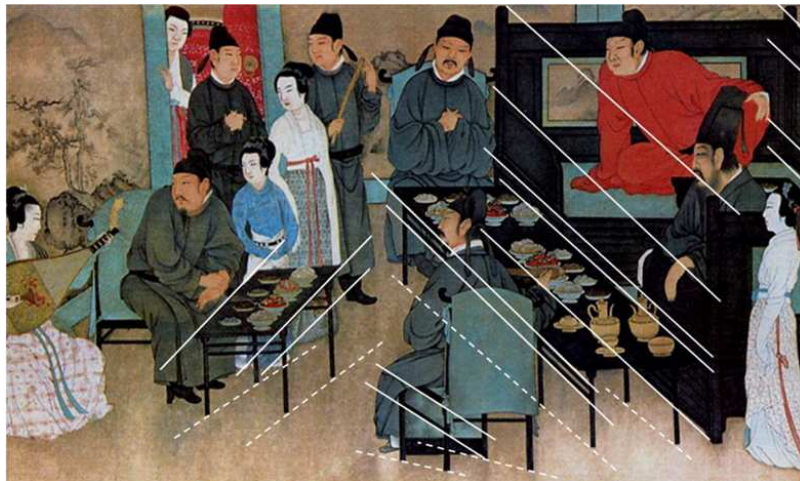
Figure 2. Han Xi-zai Gives a Banquet (retouched sector of extended scroll); Gu Hong-zhong (~ 950). Solid white construction lines reveal the strong dominance of parallelity within surfaces (orthographic perspective). Dashed white lines complete the implied surface where the chair and table legs meet the floor. Though parallel between the two pairs of table legs, they show a pronounced lengthening of the rear legs relative to the front legs in each case, violating the parallel requirement of orthographic perspective.

The third paradoxical aspect of the Shepard illusion is that the rear legs of the tables appear to be shorter than the front legs. This effect seems to derive from a contrast with the ‘inverse perspective illusion’ of the parallelogram shapes of the tabletops discussed above, making the tabletops appear wider at the back than at the front. Conversely, the rear legs of the tables appear shorter than the front legs, despite the fact that they are physically the same length (and that they define similar parallelograms alongside those of the tabletops). This apparent shortening of the rear legs seems to be induced in contrast with the apparent widening of the back of the tabletop, despite the fact that the back is at the same perceived distance as the rear legs. It is not obvious that this contrast should occur, since the bottoms of the legs are one edge of the vertical parallelogram defining the plane of the sides of the tables, which might be expected to show the same illusory expansion as the tabletop. One explanation for the different perceptual treatment of the top and the sides may be that the illusory expansion depends on the presence of complete boundaries around the surfaces so that the vertical parallelogram loses its effectiveness as a depth structure because the legs are seen as individual objects rather than components of a rectangular figure.