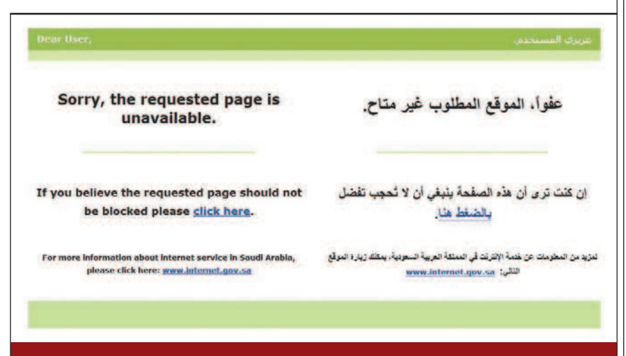
Figure 2. State-sponsored Web censoring. In many countries—in this case, Saudi Arabia—a user who requests a government-prohibited website is presented with a blockpage explaining that the site is disallowed.

Consequently, Chinese users are uncertain if a website's inaccessibility is due to deliberate filtering or random congestion in the Internet. This unpredictability actually makes Web censoring more effective because people cannot learn how