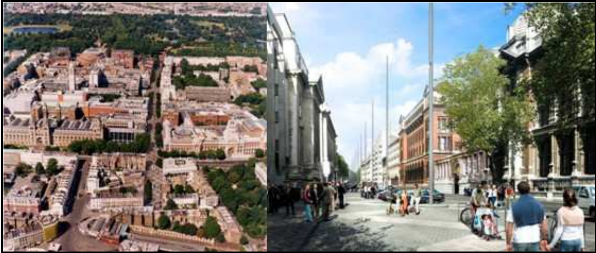
FIGURE 1 Impression of Exhibition Road post-implementation of the shared surface