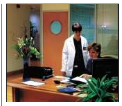
Refractive surgery clinics like Maxivision can broaden optometrists' professional horizons

"One of the down sides of High Street practice is the length of time it takes to organise a referral to the Hospital Eye