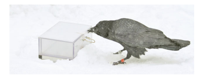
Figure 1. Photo of a raven opening the Velcro (also see electronic supplementary material, videos S1 and S2).

make contact with their immediate neighbour, then A–B and B–C were considered sitting close, but A–C were considered to be sitting on the same branch.