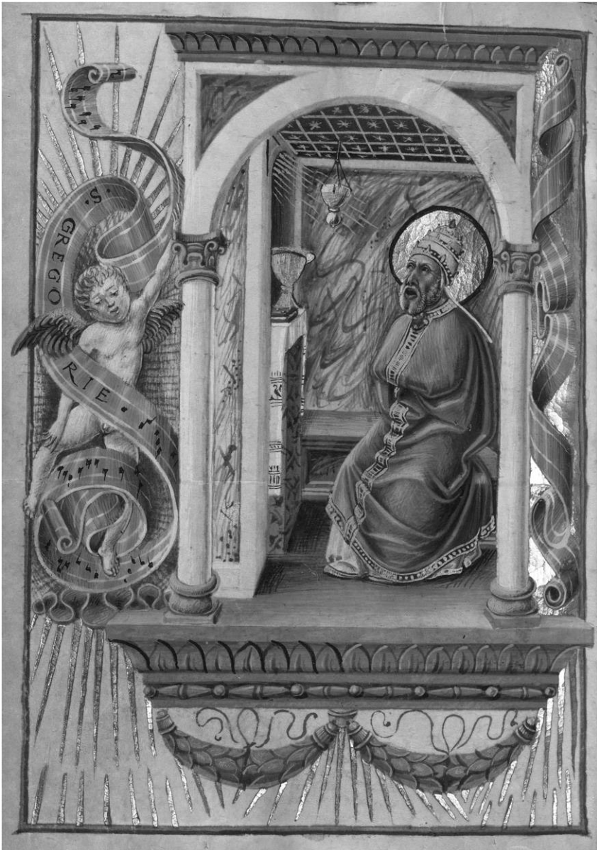
Figure 6. Taddeo Crivelli. Saint Gregory the Great, ca. 1469. J. Paul Getty Museum, MS Ludwig IX 13, fol. 172 v .

song and his gaze lifted to the heavens whence emanates a golden radiance. In the lefthand margin, an angel bursts forth in a blaze of heavenly light on a blue cloud, bearing a swirling scroll of music on which is inscribed “S. GREGORIE.”