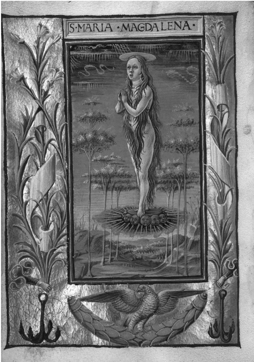
Figure 5. Taddeo Crivelli. Saint Mary Magdalene, ca. 1469. J. Paul Getty Museum, MS Ludwig IX 13, fol. 190 v .

celebrated by singing angels and that the psalm they are about to recite is a song. However, it does not require the reader to utter a melody; rather, it prompts them to sing in the heart, a practice that will draw them closer to the divine. The Saint Catherine page presents an example of good devotional practice in which reference