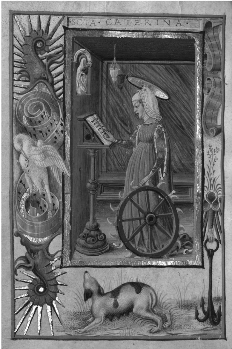
Figure 3. Taddeo Crivelli. Saint Catherine of Alexandria, ca. 1469. J. Paul Getty Museum, MS Ludwig IX 13, fol. 187 v .

wheel, the only indication of her grizzly martyrdom. In the margin beneath the miniature is a dog, symbol of good faith and constancy, the praiseworthy qualities demonstrated by Saint Catherine during her encounter with the Emperor Maxentius (r. 306–12). The dog, conspicuously depicted as female,