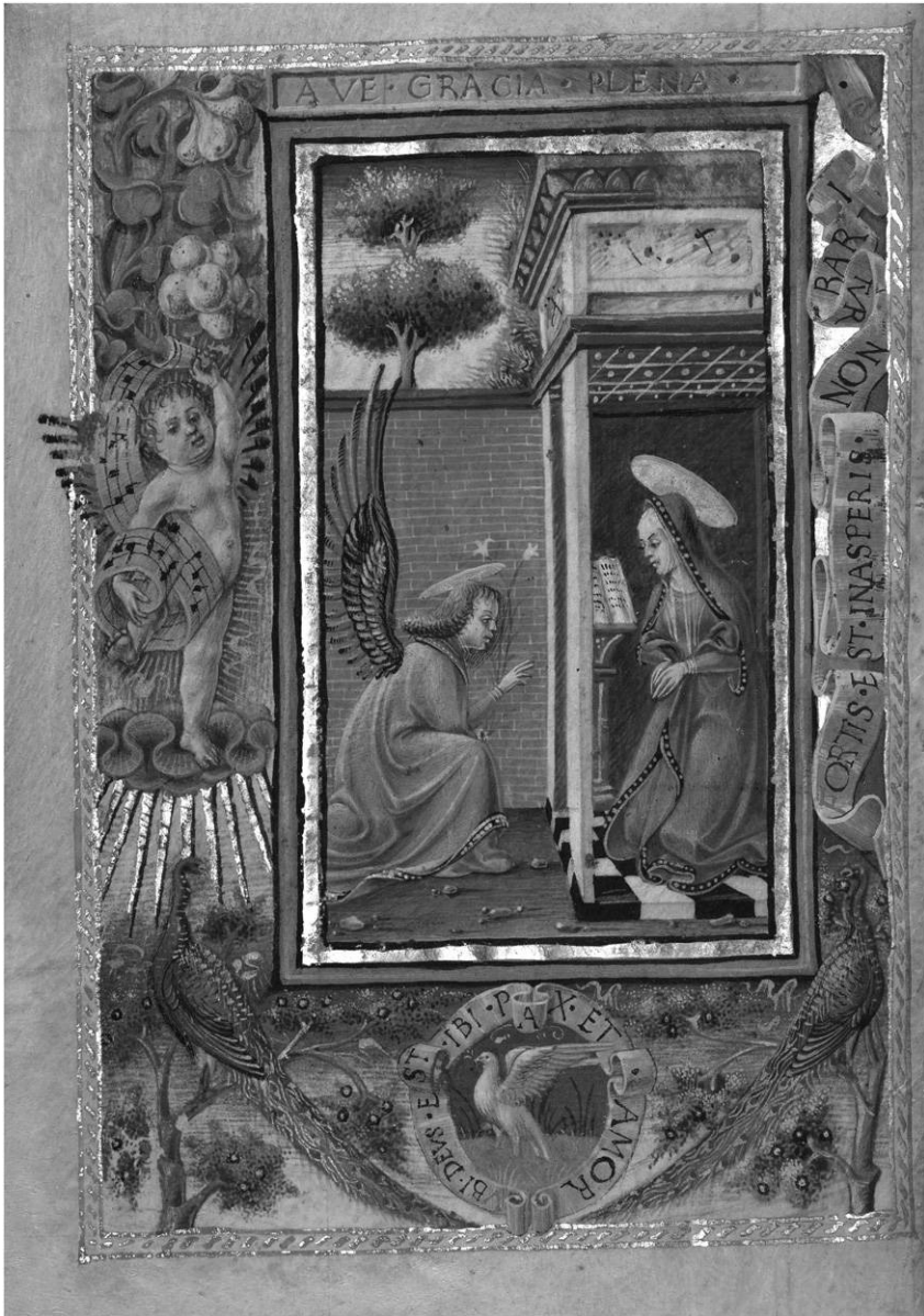
Figure 1. Taddeo Crivelli. The Annunciation , ca. 1469. J. Paul Getty Museum, MS Ludwig IX 13, fol. 3 v .

Version [ESV] numbering). In the initial D is a miniature showing the Virgin and Child, to whom this biblical prayer should be addressed.