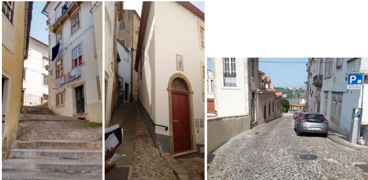
Figure 1. Images of the exercise location (the “Alta” neighbourhood in Coimbra)

Brigades, two police forces, namely the Police for Public Security (PSP) and the Municipal Police, and the safety office of UC.