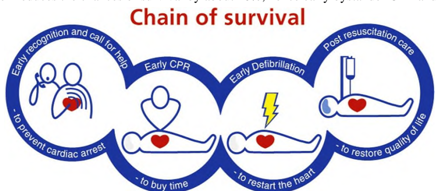
Figure 1: Chain of Survival 3

The chain of survival (Figure 1 3 ) ensures that an OHCA victim has the best chances of survival and outcome. Having the right information at each of the chain link is key to the effectiveness of the entire chain. In this paper, we present how digital technologies are used and how data is acquired, maintained, retrieved, and applied to support the chain of survival.