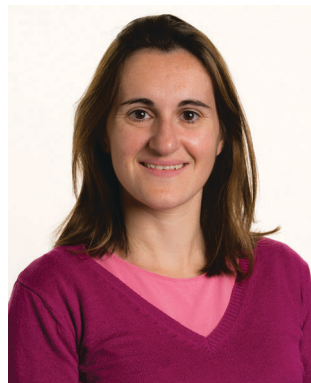
Antonia P. Sagona

b. In vivo methods. In vivo methods have been used for bacteriophage engineering involving marker-based or marker-less selections of genetically modified bacteriophages. The most