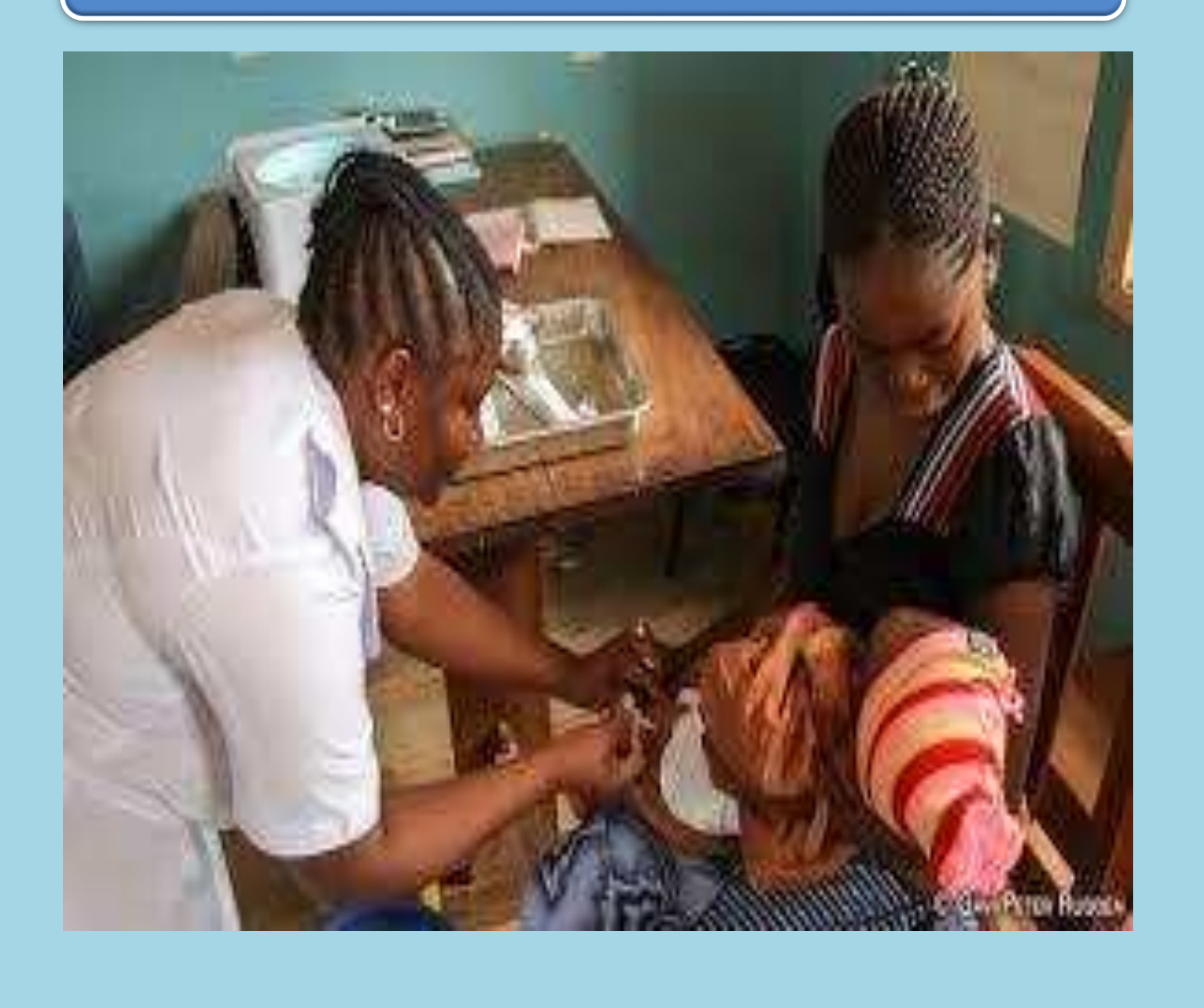
Figure 2: example of MCH services

Although evidence shows that CHW programmes are effective in improving the health of mothers and their infants [2], greater clarity is required to understand what makes CHW programmes successful, for whom and under what situations.