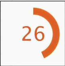
Figure 2: An example view of the RESPECT feasibility study ECG webpage. Note the form to record the participant’s response (bottom left) and the timer, indicating the time remaining before the ECG is removed from view (bottom right)