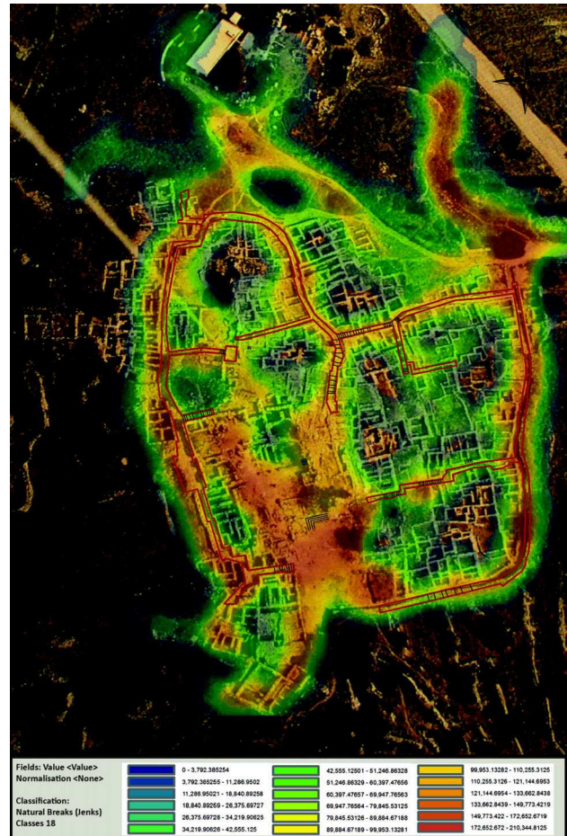
Figure 1. Aerial image of Gournia overlaid with the density analysis results.

assessment of the use and positioning of such interpretive media. Interpretive panels play an important role in the way people move around archaeological sites, functioning as Points Of Interest (POIs) and as direction aiding tools. The analysis of the data can provide significant information about whether visitors passed by interpretation boards without reading the information, if they did how much time they spend reading them or whether the position of existing interpretive boards is the optimum for visitors and the presentation of the site. Such observations can be brought to the forefront at the stage of site assessment via this analysis and visualisation and can aid significantly future interpretive agendas.