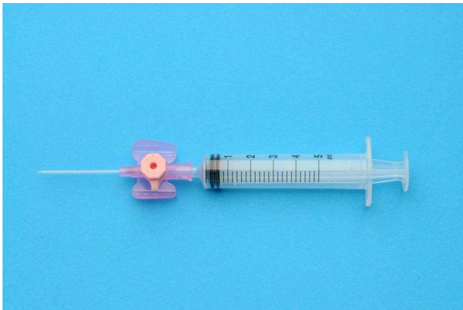
Figure 1 The bi-antibiotic paste delivery system using a 5ml syringe and the plastic part of a pink intravenous cannula.