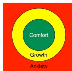
Figure 1: The growth zone model

Drawing upon Dweck's notion of growth mindset [7], we have found it helpful for learners and coaches to think of mathematical resilience as what is needed to stay, safely, for as long as possible in the 'growth zone'. This zone is immediately beyond what a person is able to do reliably, without aid or support. The growth zone model was further expanded in a previous paper [2], and the diagram is reproduced here as Fig. 1. It is our experience that this idea of a growth zone needs explicit teaching, to help learners overcome their prior experiences of mathematical harm, to become aware of their emotions, attitudes and beliefs, and to learn actively to manage mathematics anxiety.