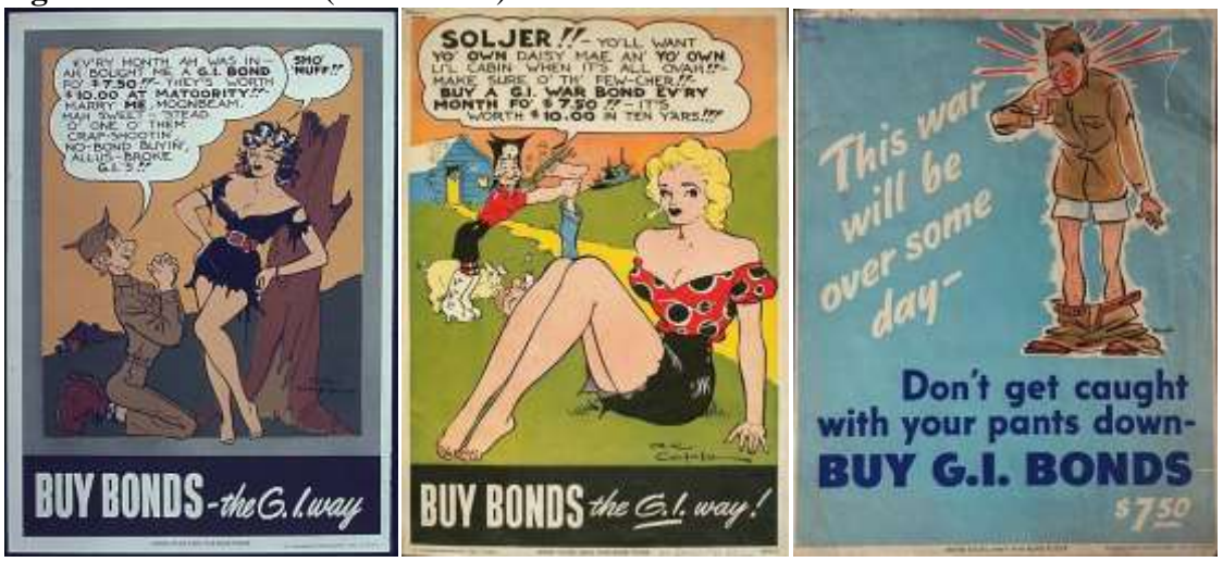
Figure 1: War Bonds (USA 1940s)<sup>52</sup>

The middle poster not only implies sexual excitement as a direct consequence of buying a war bond, but also a return to rural tranquillity, complete with farm and cattle, at a time where roughly 13 per cent of the American labour force was still employed in the farming sector. Indeed, this poster suggests that finance is not just about big city slickers, but for the small man from the countryside. On the third image, again, the issue of the man and his manhood is a central focus. It suggests that by buying bonds men can retain a sense of dignity, finance as a way of avoiding shame, of being caught with your pants down.