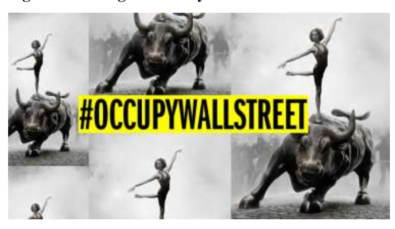
Figure 5: Taking the Bull by its Horns<sup>72</sup>

What we see at play here is a subtle shift of how the state-finance relationship is understood and enacted. There has been a reversal in the gendered assumptions that underpin this relationship. Now it is the good housewife (both literally, but also standing at the helm of nations or organisations such as the IMF) who has to 'take the bull by the horns' as one prominent Occupy Wall Street slogan suggests. This change in the gendered stereotypes of finance is clearly portrayed in artistic representations of attempts to reassert control over finance. As figure 5 shows, the bull has to be put on the leash, it has to be domesticated. Women have to stand 'on top' of finance (left image). Yet, even within these highly sophisticated critiques of finance, there seems to be a strongly hetero-normative tendency, pitching the two sexes against each other in a fight of who controls finance and future wellbeing and the economic practices (such as consumerism) that this entails. This is the case even in satirical interventions, such as a recent Adbusters campaign (right image).