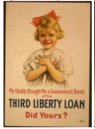
Figure 3: Liberty Bonds II (USA 1910s)<sup>58</sup>

Finally, there is a note of hetero-normative discipline as expressed in the left image of figure 3. The father/protector is being 'guilted' into buying bonds by comparison with other mythical fathers. Being a responsible father no longer solely entails the typical parental duties, but also being a responsible investor. As ever the notion of the father protector is implored to act on hetero-sexual instincts diametrically opposed to the sex drive enlisted in figure 1. Equally, the rosy domestic image of the first picture in figure 3, contrasts starkly with the apocalyptical scenes of the last two images. Here, buying bonds is the only protection against a shadowy enemy, the only barrier between us and a burning inferno. The message is very clear: if you don't buy bonds, you and your beloved and all you hold dear will be swallowed up by war. Somewhat ironically from the current crisis vantage point, bond finance is here portrayed as stable, a safe haven from chaos.