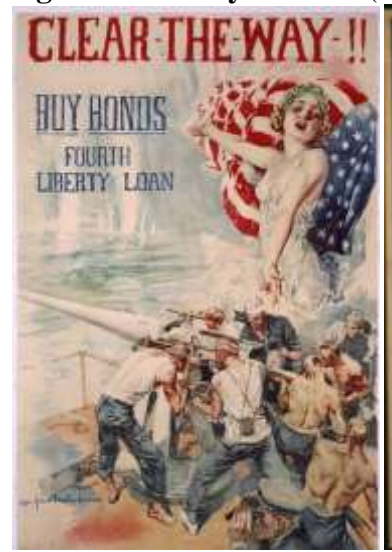
Figure 2: Liberty Bonds I (USA 1910s)<sup>57</sup>

The ideal types of the woman – as 'virgin', 'mother', and 'crone' – are called upon to invest, as a subtle affirmation of their gender roles, while being robbed of their individual agency as those that are merely there to be protected. These conceptions of womanhood – bound up with investing in bonds, and thus helping the war effort - are promoted in the Liberty Bond advertising campaign. Here again, the campaign was aimed at creating 'strong social pressures to buy bonds'. Moreover, with the intensification of the American war effort, the appeals of the campaign turned increasingly 'emotional', with the portrayals of 'obviously defenceless' women playing a central role. In so doing, these advertisements not only 'capitalise patriotism', as Kang and Rockoff suggest, they also capitalise patriarchy . <sup>56</sup>