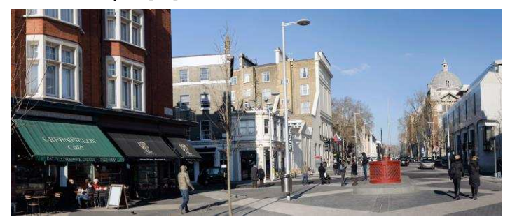
Figure 2 - Shared space, Exhibition Road, Kensington; Photo credit: Smith [29]

Shared space projects are approaches to managing roadspace in a way that supports ease of movement and use for all road users by removing physical infrastructure and instead directing traffic through the use of paint and other more 'persuasive' techniques. DfT defines shared space as 'A street or place designed to improve pedestrian movement and comfort by reducing the dominance of motor vehicles and enabling all users to share the space rather than follow the clearly defined rules implied by more conventional designs' Department for Transport [28].