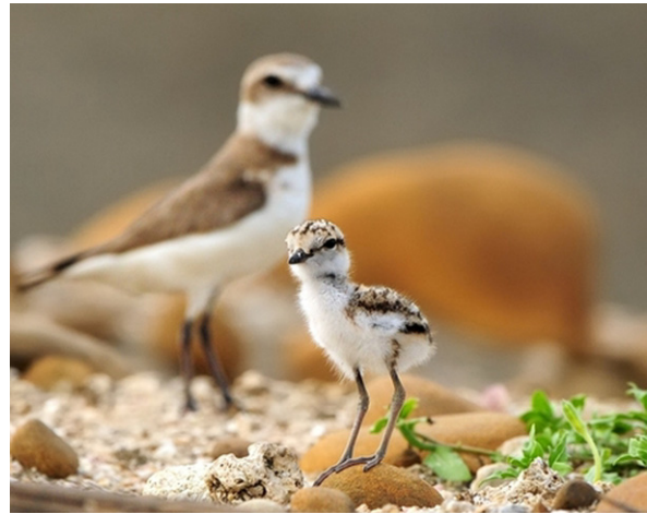
Figure 1. A Kentish Plover Charadrius alexandrinus chick attended by a parent.

Here, we investigate sex differences in body size during development in four plover populations: three populations of Kentish Plover Charadrius alexandrinus (Fig. 1) and one population of Snowy Plover Charadrius nivosus . The Snowy Plover and Kentish Plover are phenotypically similar and were long considered to be the same species (Hayman et al. 1988). Snowy Plovers are on average smaller than Kentish Plovers (tarsus length c. 25 and 29 mm, respectively; Küpper et al. 2009) but adults in these four populations exhibit very similar, moderate, male-biased SSD ( c. 1 mm, or 4%, difference in tarsus length, Küpper et al. 2009, T. Székely unpubl. data). Plover chicks are preco-