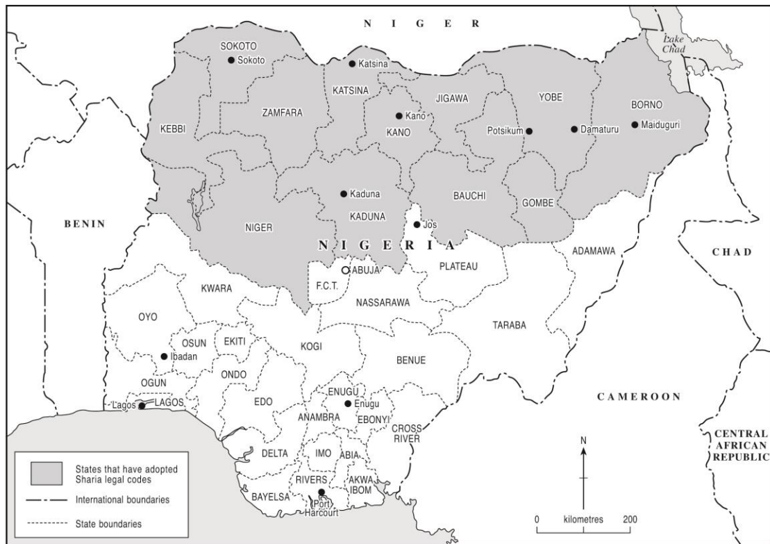
Figure 1: Sharia in Nigeria