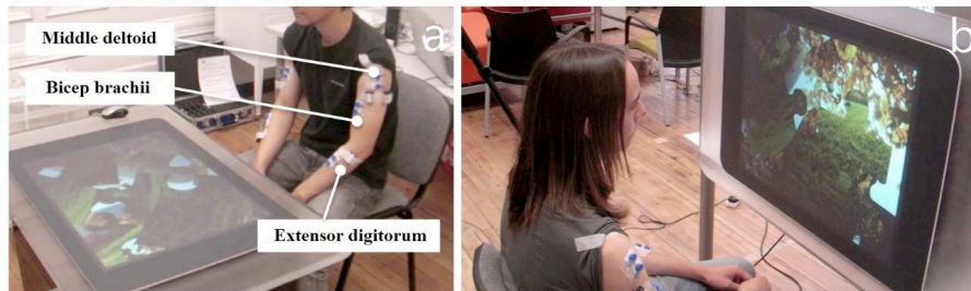
Fig. 1. The experimental set up for the horizontal (a) and vertical (b) configurations

Eighteen males, who were familiar with multi-touch technology and were free of musculoskeletal disorders, took part. The mean age was 26.4 ( \pm 4.6 ). Three were left-handed. The tabletop was raised to a height of 26" using wooden panels to allow comfort and participants sat on a chair 18" in height (Figure 1a).