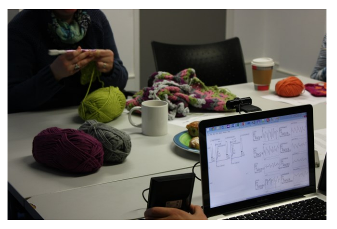
Figure 2. Participant using WAX augmented crochet tool.

Workshop 2 was run with four participants from the crochet group, three of which had attended workshop 1. The workshop was structured around three sections. We began by discussing the new sonifications with the participants and how they worked. Each participant then used the new sonifications and we finished with a focus group-style discussion. One of the researchers asked questions throughout the session to prompt discussion of their experiences of using the new sonifications and comparisons with the sonifications in workshop 1.