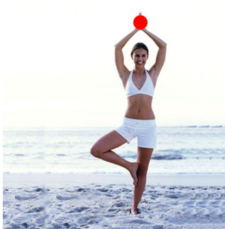
A. Familiar posture