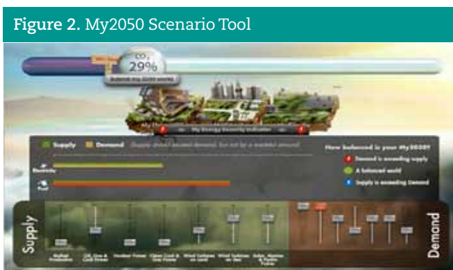
Figure 2. My2050 Scenario Tool

It is possible to ask multiple different questions of data in the analytic process. The questions that have been asked for the analysis reported here are not exhaustive but were derived from academic literature, policy consultation, expert interviews and through input from our advisory panel (see appendix). Additionally, emergent concerns that arose through discussion and appeared as particularly salient for members of the public were treated to analytic scrutiny. It is important to highlight that this form of research and analysis allows for insights into the values and concerns that underlay expressed preferences.