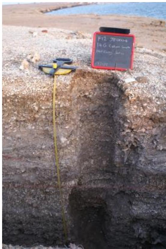
Figure 7. West facing section of Janaba 4, after removal of the column samples from 14G. The sign board is 30cm wide (excluding frame). 17 November, 2012.

near the thickest part of the mound at its centre; and 14G, which samples a wider range of shell layers with differing characteristics nearer the north end of the section (Figures 7, 8 and 9).