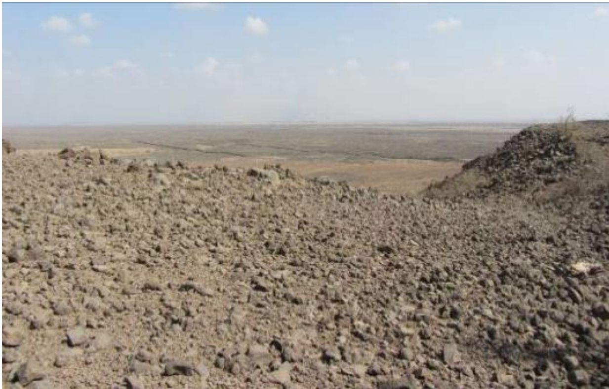
Figure 12. WP041, looking NE - lithics were concentrated in an area of particularly fine-grained basalt boulders and cobbles on the flat surface of the jebel in the foreground. Photo by Robyn Inglis, 27 November 2012.

The lava flows in the north of the Jizan region, near Al Birk and As Shugayig, contain sites previously identified by the Comprehensive Archaeological Survey Program, mainly along the edges of the lava flows. The survey of this area identified Palaeolithic artefacts at a number of sites in the area in different settings (Figure 1). These include the following: