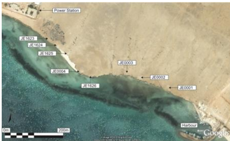
Figure 11. Google Earth image showing the location of the Janaba 4 shell mound and the other shell mounds in the vicinity, from which samples were collected. Map prepared by Matthew Meredith-Williams.