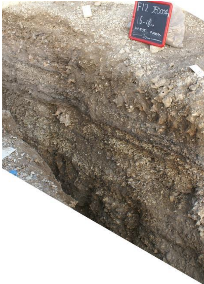
Figure 4. Part of the west facing section of Janaba 4, after excavation of the central section of the trench down to the bedrock. The horizontal banding of layers with clean Strombus fasciatus shell alternating with dark ashy layers is clearly visible in mid-section. At the top right of the section, there is a layer dominated by large gastropods of Pleuroploca sp. and Chicoreus sp., with an earthy matrix. This layer rests unconformably on the horizontal layers of small shells and ash, and lenses out towards the left of the image. The sign board is 30cm wide (excluding frame). Photo by Geoff Bailey, 14 November 2012.

The sections clearly demonstrate the varied nature of the deposits in the mound and the nature of their accumulation and stratification. In the central part of the mound the deposits show a near-horizontal banding with thick layers of shell dominated by the small gastropod, Strombus fasciatus , alternating with thinner ash-rich layers, often rich in fish bone, which show up as black bands in the section (Figure 6). Higher up in the section, it is clear that the deposits