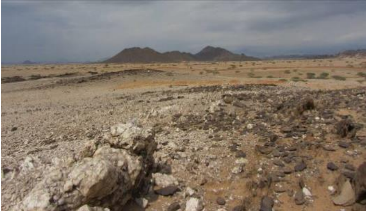
Figure 14. View from WP056 looking N towards WP057 and 055, visible as dark linear features on the otherwise relatively flat landscape. Photo by Robyn Inglis, 29 November 2012.