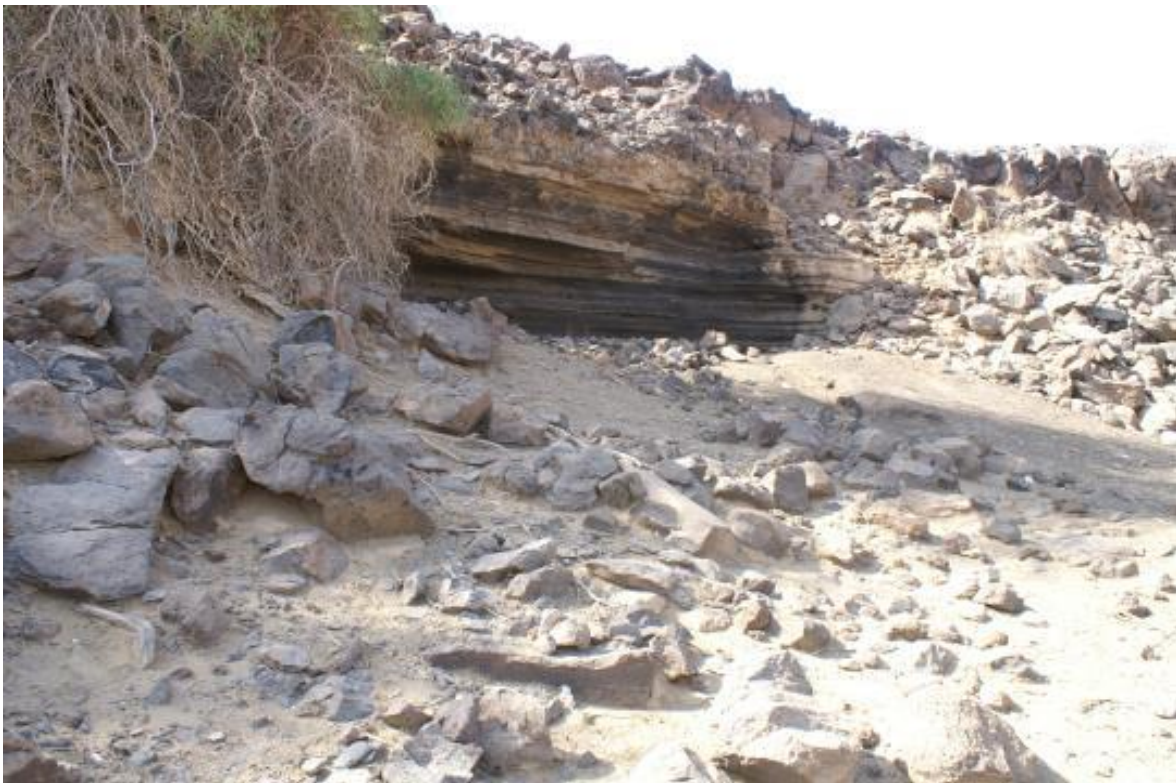
Figure 15. Rockshelter formed in a sandstone cliff capped by a lava flow on the edge of a wadi near As Shugaig at Waypoint 049. Photo by Geoff Bailey, 27 November 2012.