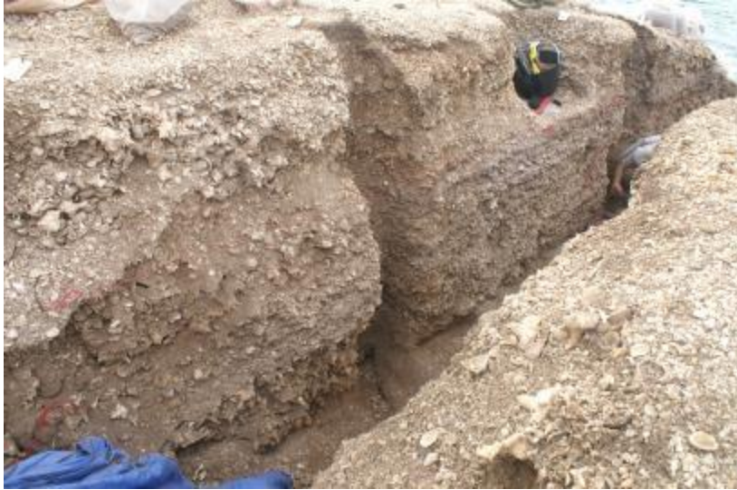
Figure 9. General view of west-facing section of Janaba 4 after removal of column samples, looking towards the South. Note the layer dominated by large gastropods ( Pleuroploca sp., Chicoreus sp.) at the top left of the section and thickening towards the left of the image. Photo by Geoff Bailey, 21 November 2012.