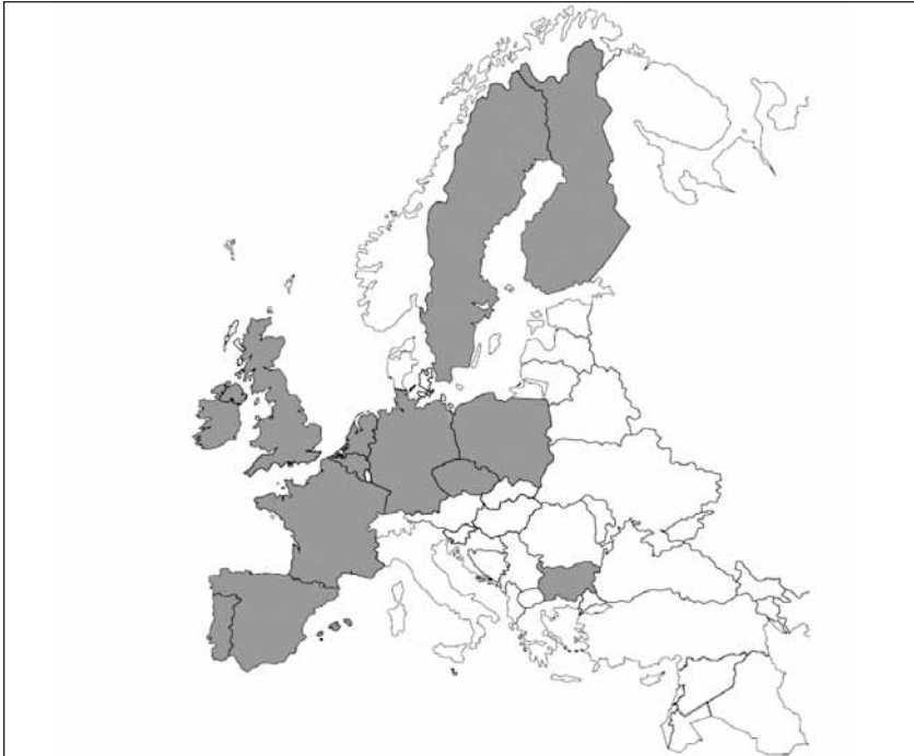
Map 3.1: The responding countries

A questionnaire was distributed to social housing experts in Belgium (Flanders), Bulgaria, the Czech Republic, Finland, France, Germany, Ireland, Netherlands, Poland, Portugal, Sweden, Spain and the UK (Map 3.1). Most of the experts were able to answer the questionnaire in English, but translation of the questionnaire and responses was undertaken where necessary. A list of the responding experts is presented in Appendix 1 .