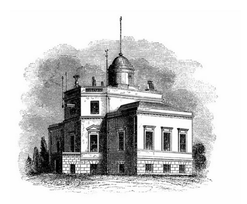
Figure 3.1 An engraving of Kew Observatory made in 1851.

of its work was self-financing and on a commercial basis. The observatory was by then headed by a full-time, paid superintendent with scientific qualifications. In this chapter, I show how this transformation happened.