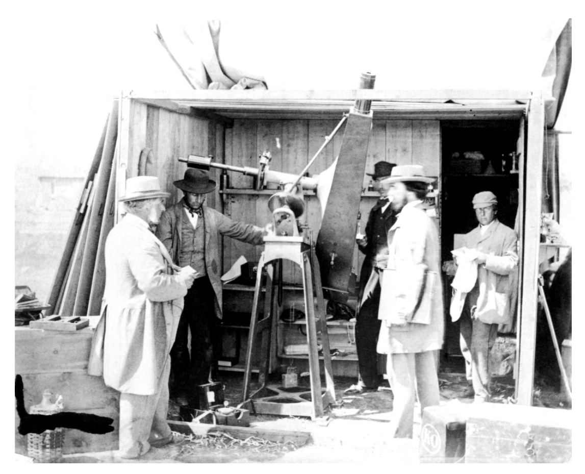
Figure 4.1 The Kew photoheliograph, observing hut and observers at the 1860 total solar eclipse in Spain.

at the time was helping to build the Spanish railway network.<sup>58</sup> The expedition was nevertheless an outstanding success. De La Rue and his assistants duly set up the photoheliograph and hut at the village of Rivabellosa in northern Spain and the total phase of the eclipse was seen in a clear sky. Two photographs taken at different stages of totality successfully showed the prominences. The movement of the Moon over the prominences during the course of the eclipse, plus the perfect coincidence of the positions of the prominences on both photographs, confirmed for De La Rue the solar origin of these features. Further corroboration was provided by photographs taken nearby by Vatican astronomer Angelo Secchi and others.<sup>59</sup>