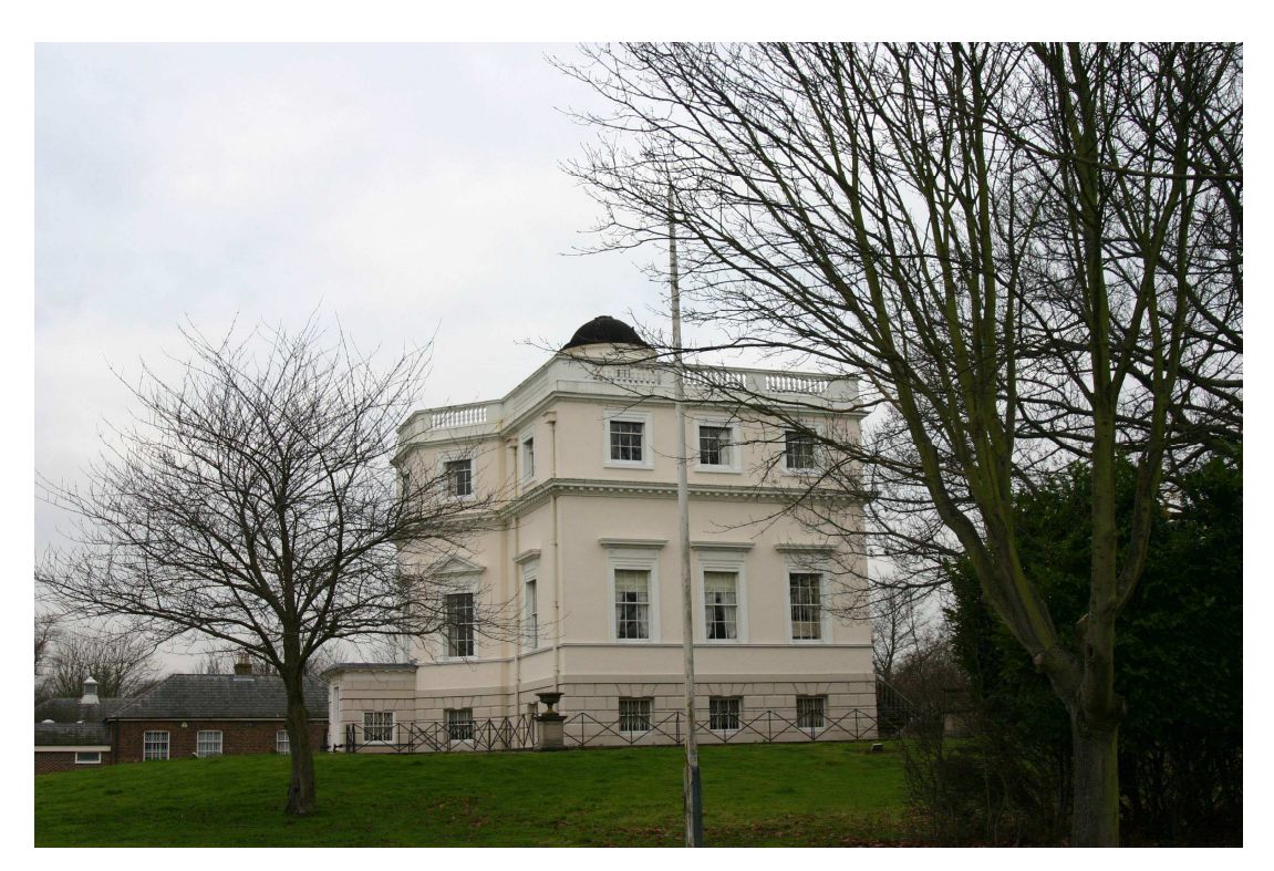
Figure 1.1 Kew Observatory in 2012.

also allows us to tackle some major issues that are of great current interest to historians of science in the nineteenth century. The history of the observatory from its acquisition by the BAAS in 1842 to its becoming a part of the NPL in 1900 is almost exactly coincident with the reign of Queen Victoria (1837-1901) and thus practically the entire span of what we might call 'Victorian science'. In this thesis, I will address these issues by asking three major questions about Kew Observatory.