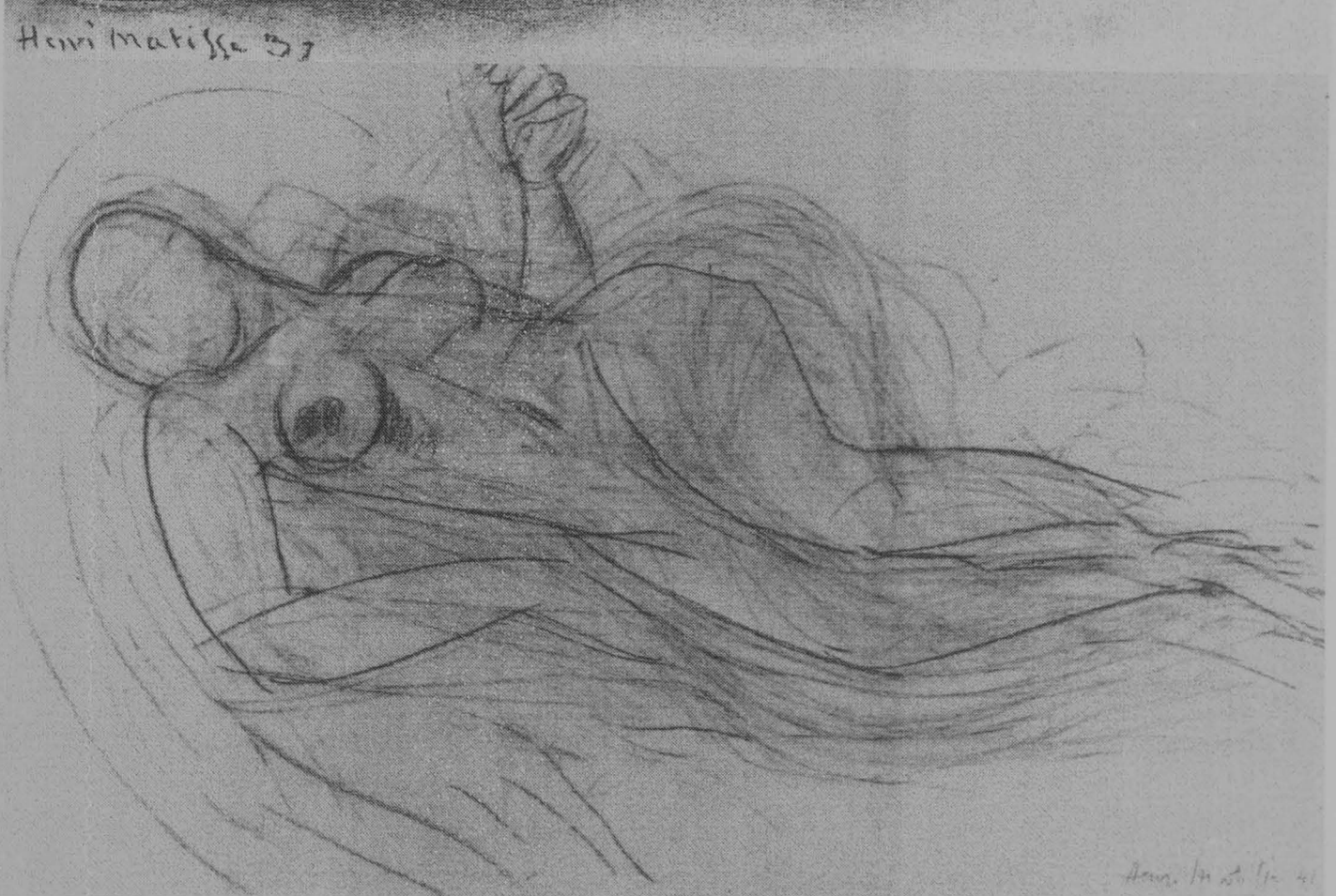
Fig 3 Reclining Nude 1941

By recreating a geometric image of the body, one similar to Matisse's nude, McGuckian is experimenting with questions of woman's national identity. Like most things for McGuckian, however, the idea of beauty is not absolute and she