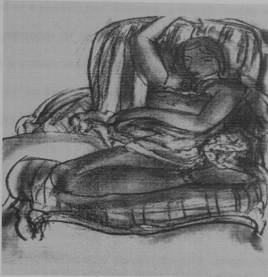
(Fig 1) Ballerina Seated in an Armchair 1944