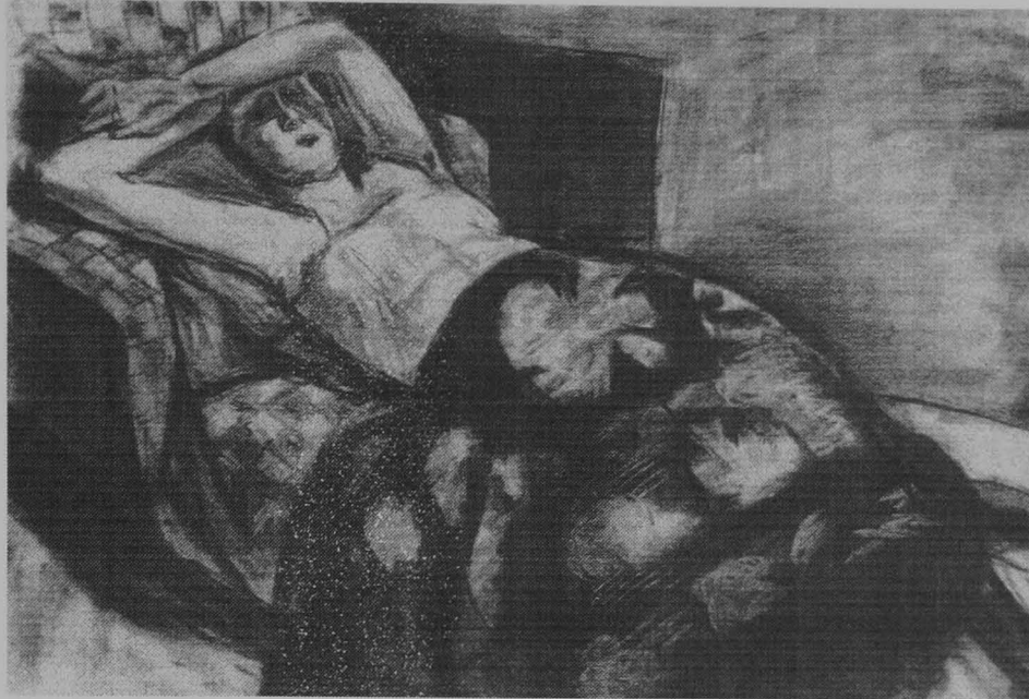
Fig 9 Reclining Model With Flowered Robe c. 1923-24

When all these snippets from Elderfield fuse together in the poetic form, McGuckian creates her own abstract portrait by piecing together different parts of bodies from various Matisse drawings. A new life is being created to replace the one that was lost. Thus, employing the same artistic technique as on the canvas / page when dislocating bodies, but rebuilding them whole: