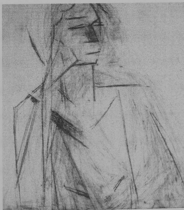
Fig 7 Eva Mudocci 1915

Discussing Eva Mudocci (1915) and Greta Prozor (1915-16), Elderfield comments that, 'These drawings have literally been reconstructed from destroyed matter. And they freeze into their temporally perceived wholes the turn of a head, the movement of a body settling under its own weight .' 65 (See Figs 7 & 8 below)