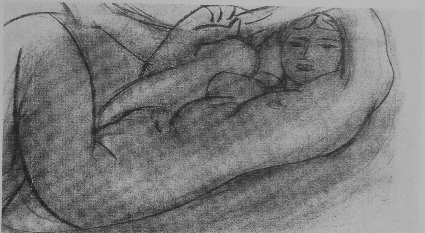
Fig 2 Reclining Nude with Arm Behind Head 1937