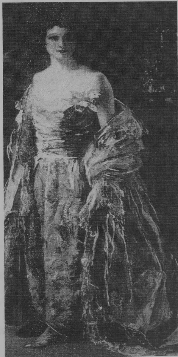
Fig 4 The Green Coat 1925