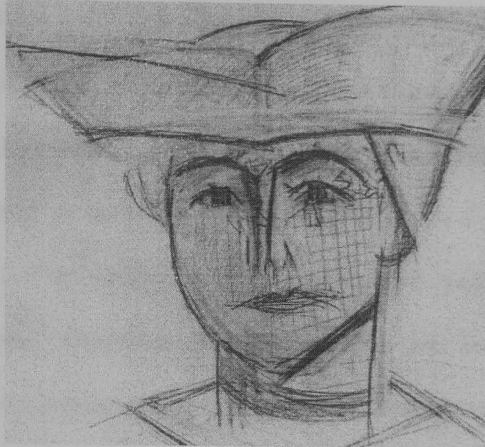
Fig 10 Madame Matisse 1915

The 'misaligned eyes' that are replicated in 'Drawing Ballerinas' are all that remains of the woman's face, almost as if she is devoid of an identity. The body becomes an horrific visual representation of sectarian violence through the grotesque robotic image of the head as a modern day sculpture. What was once a live woman's body is now viewed as sheer matter, that which is devoid of all human emotion. McGuckian presents an image of the death and destruction that lies behind a superficial image of a ballerina. As the body is stripped of its beauty, a grotesque image of a body destroyed by war replaces the ballerina's sensual delicacy. The body 'obligingly' offers itself as a willing victim to fulfil the political intentions of this piece of art. The body articulates the atrocities of political violence through its the grotesqueness. After exposing the truth the body collapses under the 'burden' of its own weight: