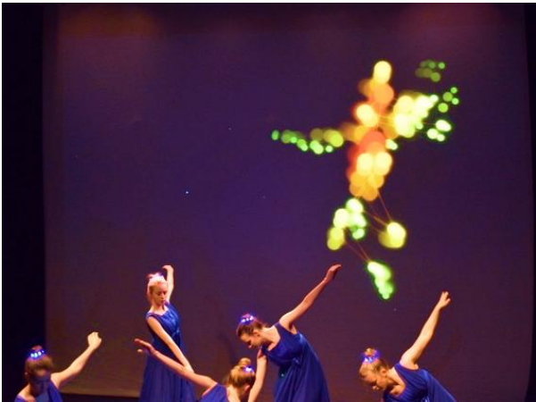
Figure 2: A virtual performer in "Algorithms"; the limb colour / point size was adapted to illustrate evolving patterns in the dancers' movements