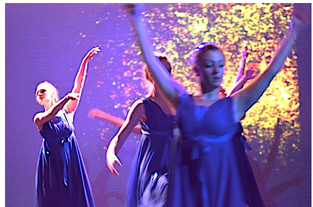
Figure 5: The evolving abstract visualisation of the virtual dancer within "Computational Thinking" highlights the geometric progression within the piece