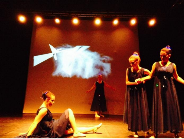
Figure 1: "Debugging" shows a dance containing "errors" which the performers slowly discover and correct; the visualisation represents the same, correct, dance but performed initially by an unrecognisable shape that slowly evolves into a dancer to represent visually the "cleaning" process