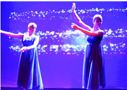
Figure 3: In the "Big Data" duet the visualisation traces the x-positions of the performers; the generated pattern eventually builds up into the actual weather patterns that were used to create the choreography