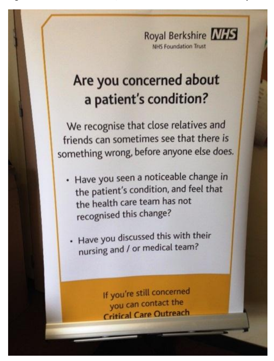
Figure 5. Call4Concern stand, located in the entrance of the Royal Berkshire Hospital