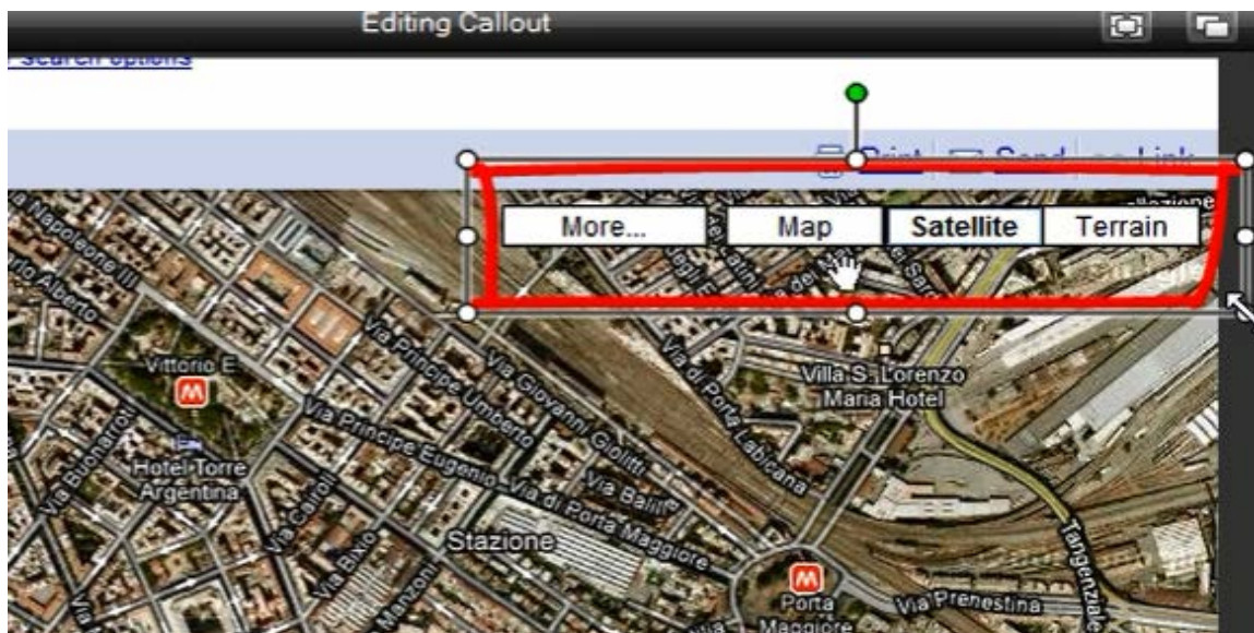
Figure 3: Camtasia Callouts

http://staffweb.worc.ac.uk/kuzma/comp1342/videos/week23/video3-1/index.html