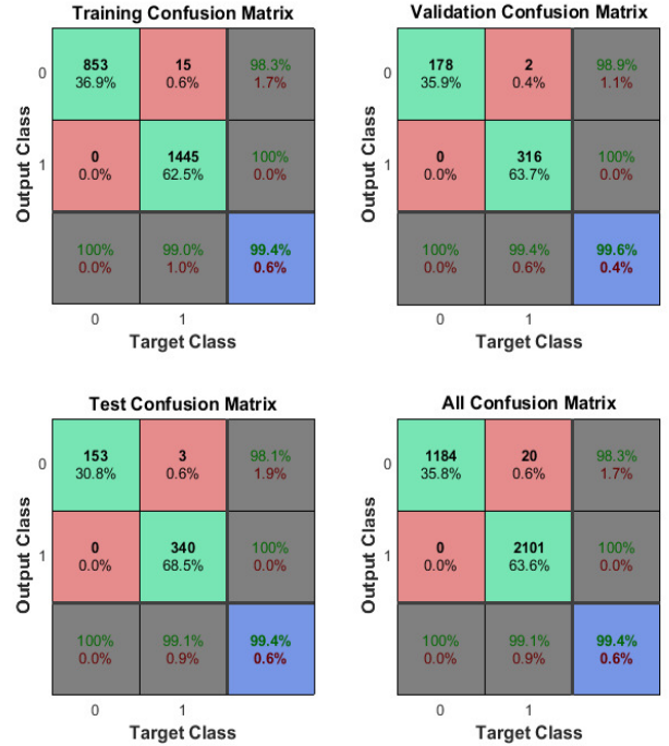
Fig. 3 Neural Network Training confusion matrix

Fig. 3 shows neural network confusion matrix plots for the training set, testing set, validation set and the all confusion matrix (overall performance) at the right bottom corner. The network output correct response values fall under two categories: True positive (TP) and False positive (FP).