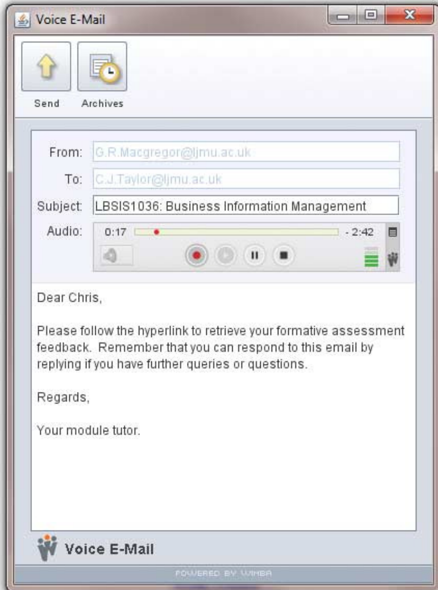
Figure 1. Creating a 'voice email' using Wimba Voice™.

was recorded by tutors based on the agreed marking criteria. This mark remained undisclosed to students.