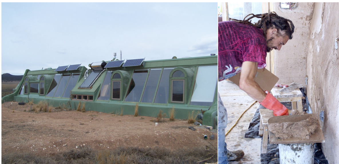
Figure 4: Left: The south face of a relatively newly built Earthship home, New Mexico, 2006. The north face, not visible here, is ‘bermed’, or banked-up, with earth from the site. Right: An Earthship builder ‘mudding’ a wall with adobe (earthen) plaster.

The Earthship’s alterity is connected to the builder-dweller’s senses of time and materiality. Earthships are built by their owner-dwellers and by volunteer labour from friends, family and others that want to learn how to build. They are built by low-tech, labour-intensive means from the excavated earth of the site itself and from salvaged materials considered ‘waste’ or ‘trash’ by society, such as used tyres and bottles. 3