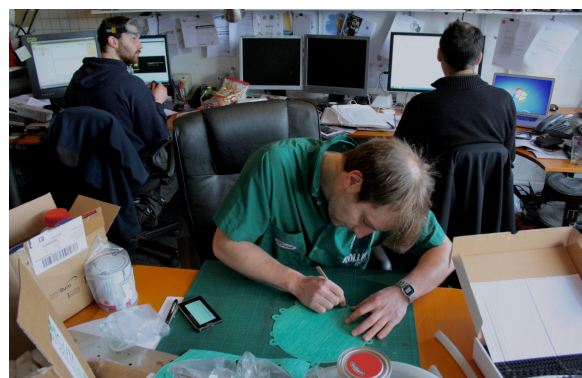
Figure 1: A typical working environment of a UK product design studio. In this case the practitioners are concurrently engaged in conversation, computation and making.

Our first field case is concerned with everyday working life in a commercial product design studio located on an industrial estate adjacent to the centre of a large UK city. Here, through 2012 to 2013, Anusas engaged in participant observation for a period of eight months: working as a full-time product designer, assisting project planning, research, conceptual design and prototype making, within a team of approximately eight people. We draw on this case because it is representative of design studios that operate within an industrial context and carry out a diversity of projects with specific creative and technical requirements. This particular studio designs products for professional, consumer, medical and energy sectors, and typically has numerous projects running in parallel with different demands on expertise and time. Its capacities of making are diverse in terms of the range of skills employed and the associated tools and materials used, and on any day it is typical to see the practitioners engaged with freehand drawing, computer modelling, calculations and prototype-making using manual and machine skills.