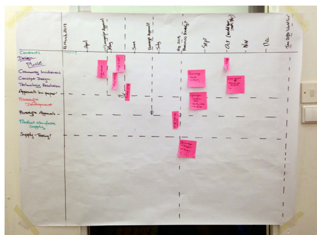
Figure 2: Project timeline drawing showing linear left-to-right progression of time and tasks across months.

Informal and formal reviews of projects also regularly involve bodily expressions of time, most typically gestured through a broadening of the arms denoting the stretch of a linear spectrum over hours, days or weeks. Furthermore, the studio commonly features material expressions of time in sketch-books and wall drawings as future-projected timelines, annotated with intervals, actions and plans: