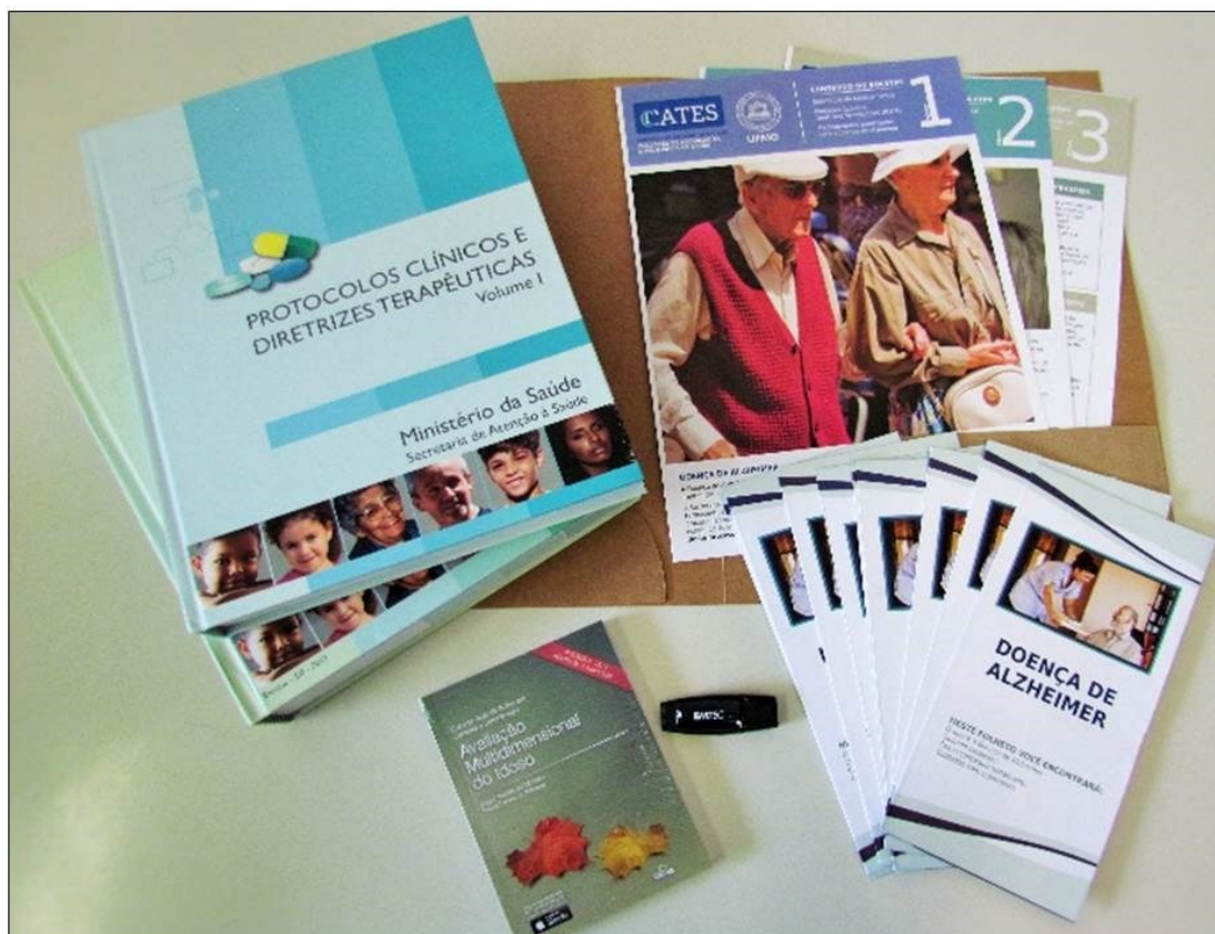
Figure1 – Materials provided for the Academic Detailing Programme in Brazil

Step 5: Selecting participants. The sample was randomly selected from a database of all physicians that requested on at least three occasions medicines for the treatment of Alzheimer's disease through the CEAF during the year prior to the study. The prescribers included psychiatrists, neurologists, geriatricians and general practitioners.