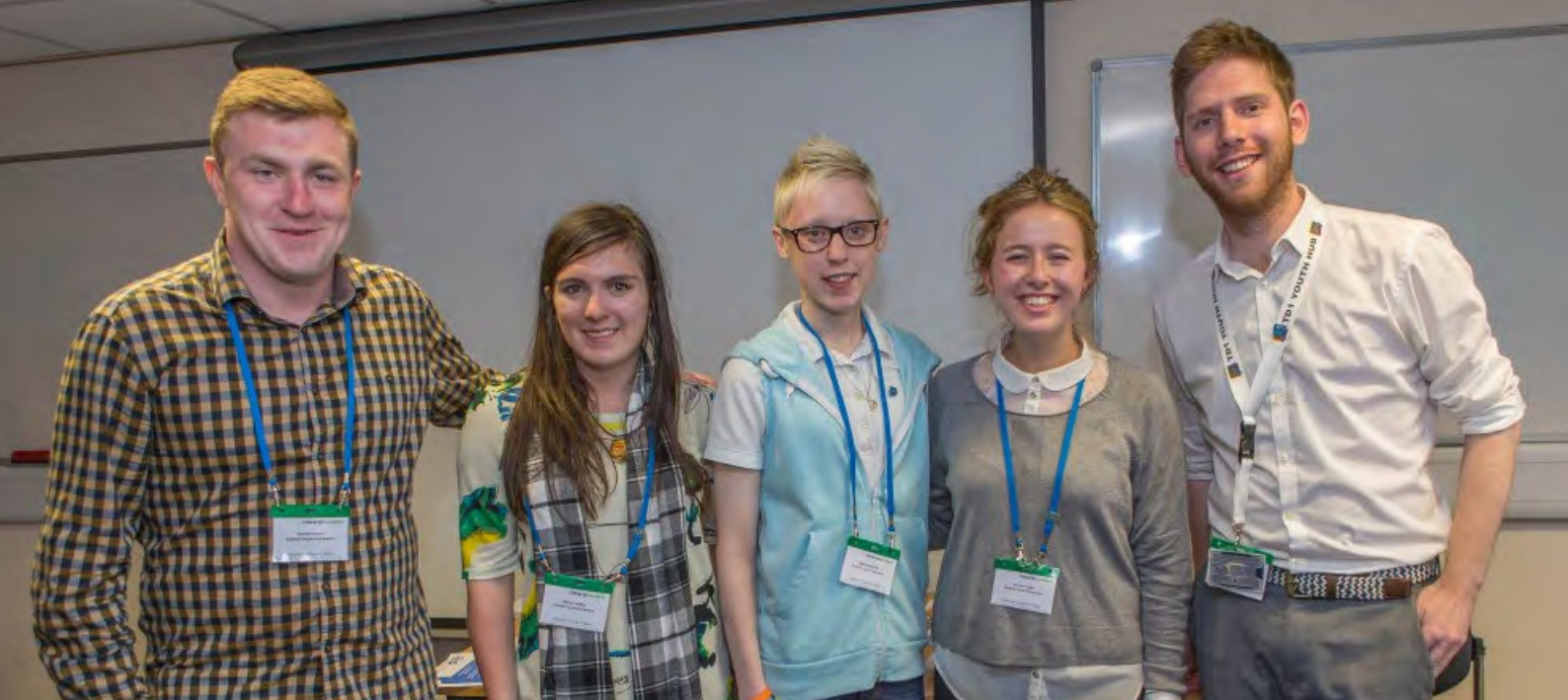
Current and former members of the Scottish Youth Parliament led a seminar session during the conference

stages, it is important to start the debate and be open to a wide range of views and perspectives, there comes a point at which Character Scotland will need to articulate clearly what it stands for given the very wide divergence in perspectives as to what character education is (reflected in different understandings of 'character'), some of which are not compatible with each other. This relates to the perspective forwarded about the lack of coherence in the field.