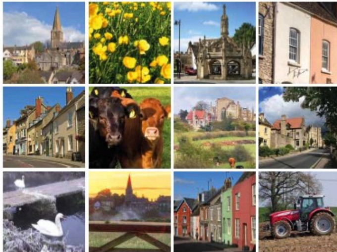
Figure 6: A Draft Neighbourhood Plan was published in January 2013, including masterplans and development briefs for the key housing site(s) and policies for inclusion in the neighbourhood plan. The aim was to establish a coherent set of design policies, against which any proposals would be assessed. [Image: Malmesbury Neighbourhood Steering Group, 2014]

Place Making and Quality Design Consultation Version 1.0, 5-March-13