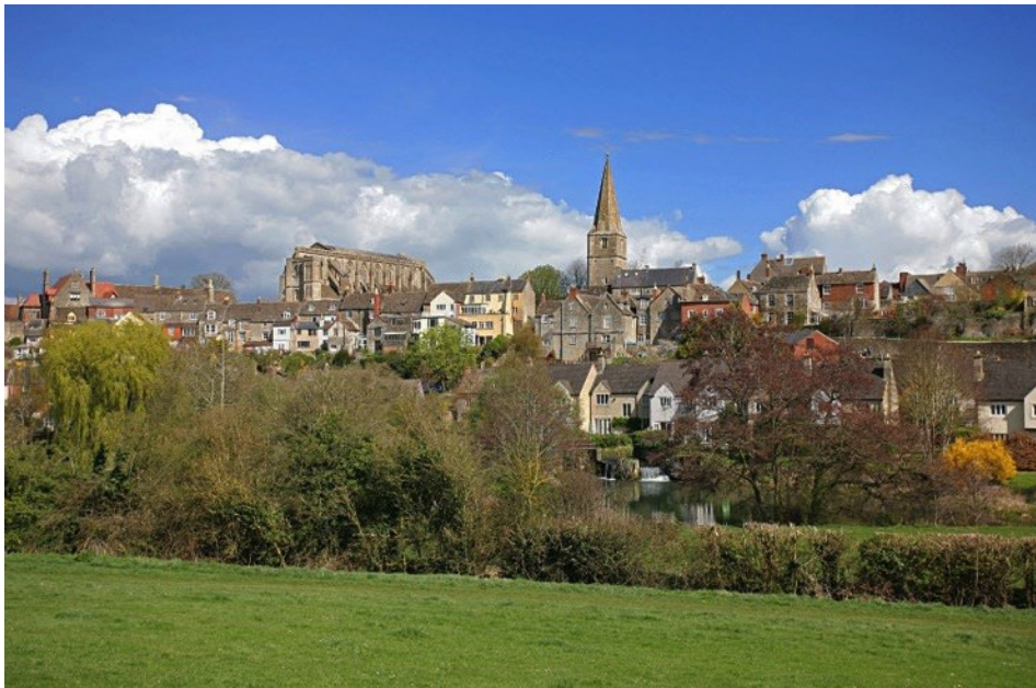
Figure 2: The distinctive urban silhouette of the town is defined by this hilltop setting, patterns of development influenced by its topography and rivers, with the prominence of the Abbey and church spire adding an undeniable element of drama.

As a ‘nuclear town’ Malmesbury clusters tightly around the Abbey and historic market place (now known disappointingly for on its primary contemporary use, as the Cross Hayes car park). With over 400 listed buildings the town’s architecture and streetscape provide distinct and treasured qualities, as well as deep-seated associations for local residents and communities. Fragments of the 12 th century medieval walls remain as does a distinct pattern of development based on the topography and its water courses. Development historically occurred at relatively high densities respecting contours of the land via terraced, or continuously connected, built forms and on generally long, narrow plots. The angle of slope on which the town is built dictates the vertical depth of the town’s visual profile, as the town is seen to layer up the hill. In Malmesbury, streets run generally along the land contours with exceptions made for a few that run straight down to the river. This pattern of development enhances the cohesiveness and richness of the townscape as few buildings can be seen as separate units.