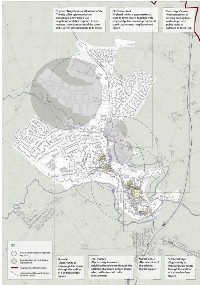
Figure 4: The EbD Masterplan for Malmesbury.