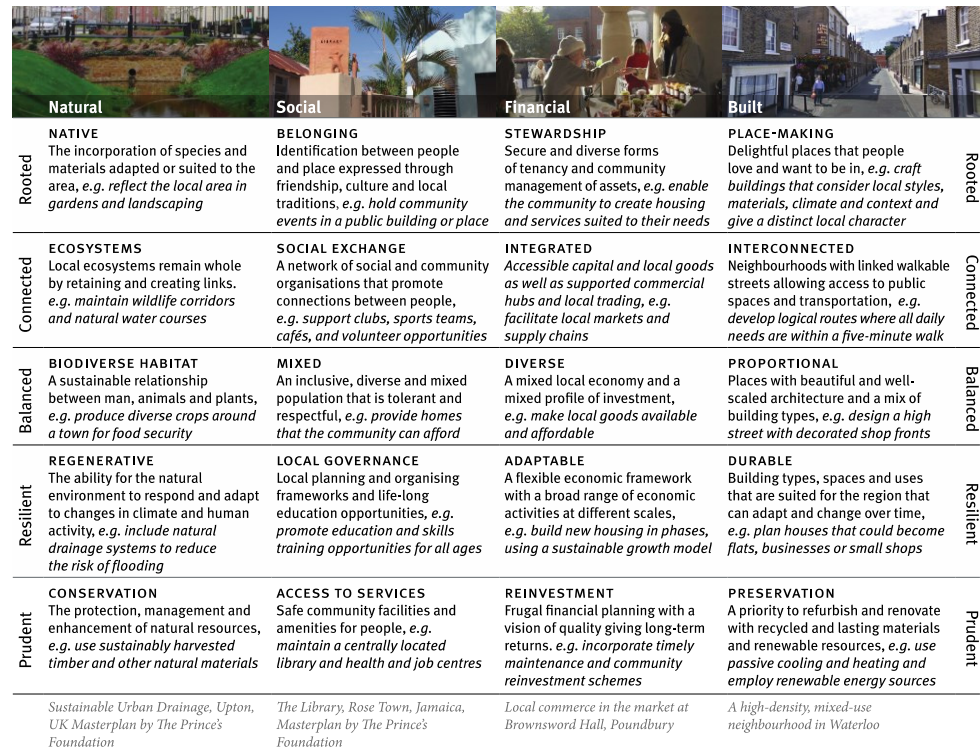
Figure 1: The Community Capital Framework: The framework draws on Christopher Alexander's Nature of Order and the notion of life as a series of patterns, or centres, which are self-supporting. This concept has been adapted and transferred to a sustainability framework whereby the vertical threads of the weave become the more usual attributes of sustainability – namely Social, Natural, and Financial Capital with Built Capital added to represent the physical framework. The cross-weave gives meaning to the capitals, stitching them together – namely Rooted, Connected, Balanced, resilient and Prudent. (Bolgar, 2014)

How the principle of community capital works at different scales