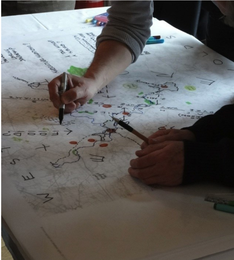
Figure 3: The EbD workshops brought local residents and stakeholders together and encouraged open debate and testing of various options to reach a consensus-based vision and supporting strategies. "They were encouraging people to think of their environment in a different way." – Simon Killane, Chair, MNSG

development, with diverging options as to how it could evolve. The ‘easy’ or ‘default’ option would be to continue the trajectory of the recent past by allowing further (sub)standard suburban housing estates and large-scale out of town retail. The challenge was to empower the community through the EbD and neighbourhood planning to develop an alternative vision for Malmesbury that not only responded to the present challenges and accommodated development but did so within a framework based on the town’s assets, as well as the aspects that form community capital, and in turn sustainability.