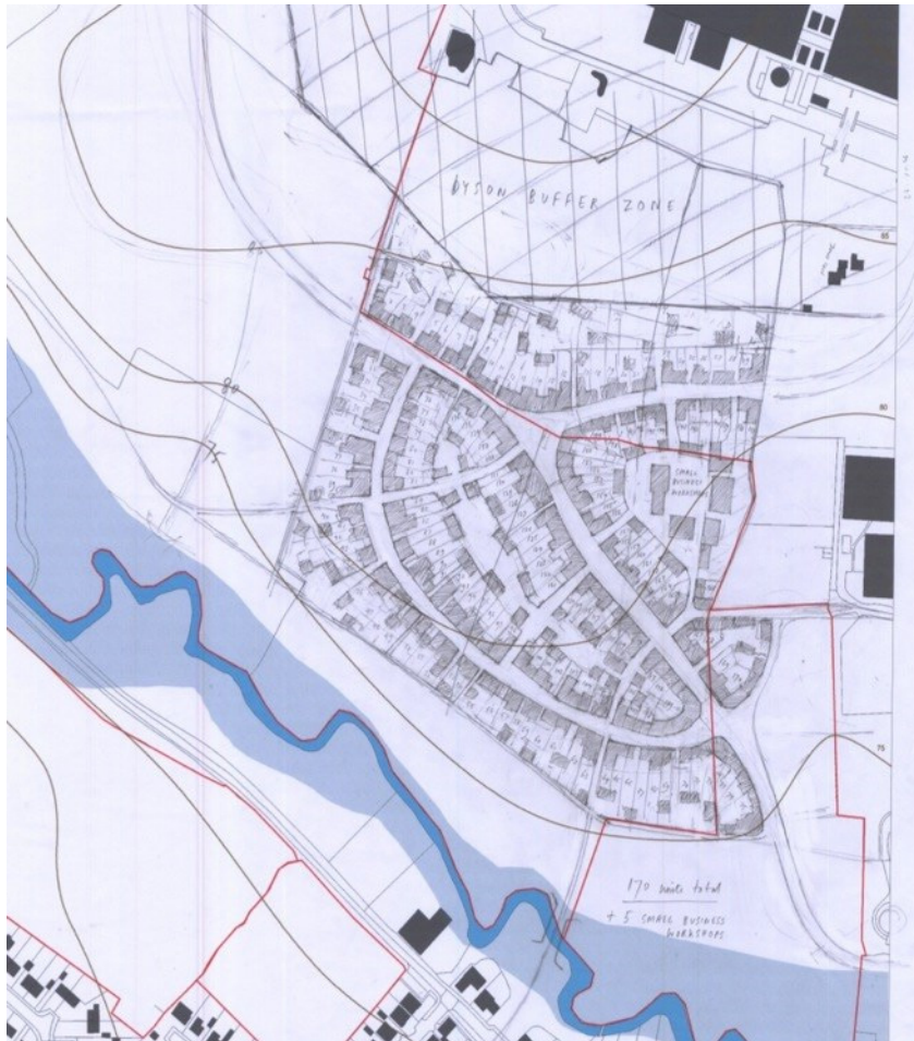
Figure 5: The masterplan for the preferred housing site evolved further through a dedicated workshop held in March 2012. The site provides the opportunity for a further evolution of the town based on the much valued and admired historical patterns of development and could accommodate a sustainable mixed use neighbourhood to meet the identified housing allocation. [Image: The Prince's Foundation, 2013]

Appropriately designed and delivered the development would build upon the town's architectural and urban character, offering the opportunity to 'terrace' up from the mead in much the same manner as has occurred within the historic core, yet without breaching the 85m threshold.