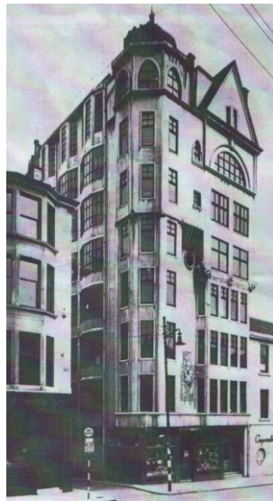
Figure 1. The Lion Chambers in early 20th century