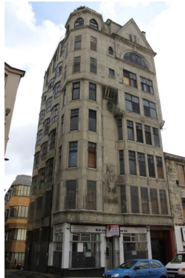
Figure 2. The Lion Chambers in 2015