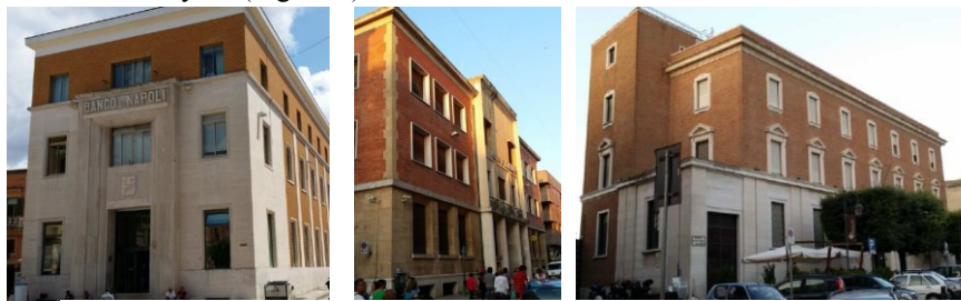
Figure 4. Banco di Napoli, Post Office and Bank of Italy

Not far from this building, the Bank of Italy (1946-1952) was built on the area of the demolished Convent of San Francesco. The austere neo-classical facade of the Bank of Italy rises from the white travertine base, punctuated by two rows of rectangular windows and finished by a red brick top. Until 2009, the building was the headquarters of the Bank of Italy; today, acquired by a private company, the property is subject to a reuse project for a hotel due to its suitable central location and layout (Figure 4).