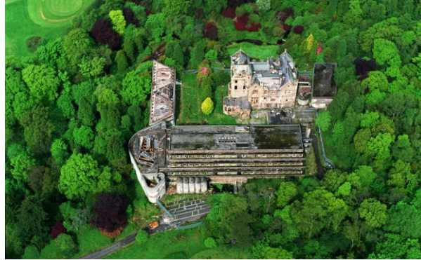
Figure 3 St. Peter's College

accommodation and became part of a new building complex containing a convent, a sanctuary and classrooms [22].