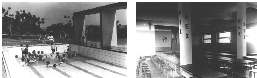
Figure 5. Holiday Camp Heliotherapeutic