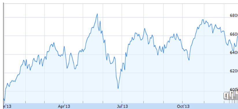
Figure 1: FTSE 100 Index: 2013