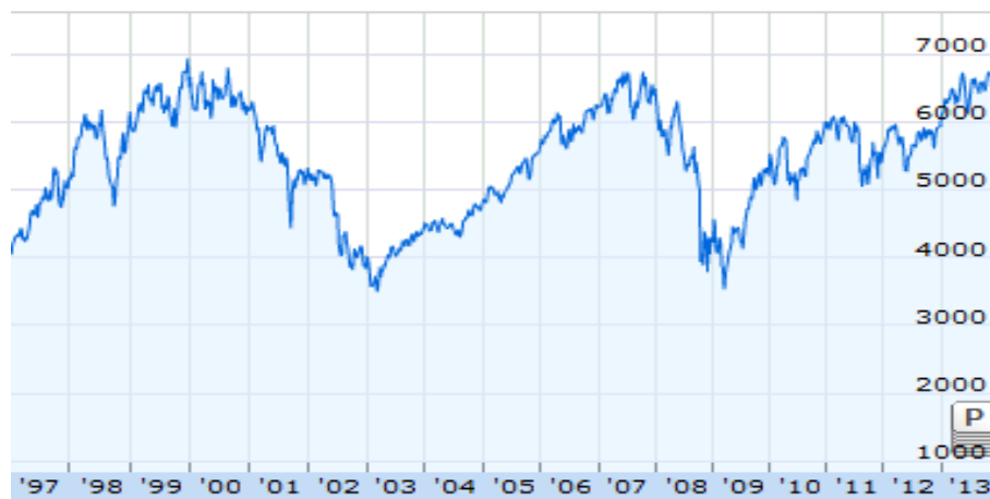
Figure 2: FTSE 100 Index: 1997-2013