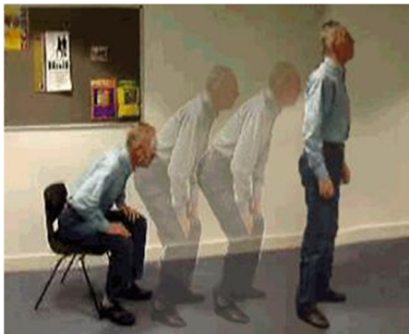
Figure 2: Sample sit-to-stand exercise

Visual feedback and gamification has been shown to give useful feedback for rehabilitation (e.g. [10]) while tactile feedback has been shown to have strong benefits for physical activity instruction (e.g. [9]). In our research we aim to combine these two elements to give tactile feedback directly to affected limbs using vibration modules linked wirelessly to a chest worn standard smartphone. Our long-term goal is to develop games and feedback mechanisms to encourage and support repetitive rehabilitation, particularly in this project assisting sit-to-stand exercise as these are a key stage of rehabilitation for many (e.g. Figure 2). In this poster we present our initial prototype and feedback.