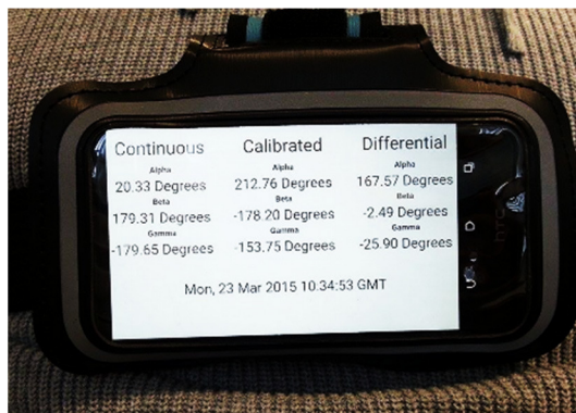
Figure 5: Calibration progress screen and sensing screen in phone mounting