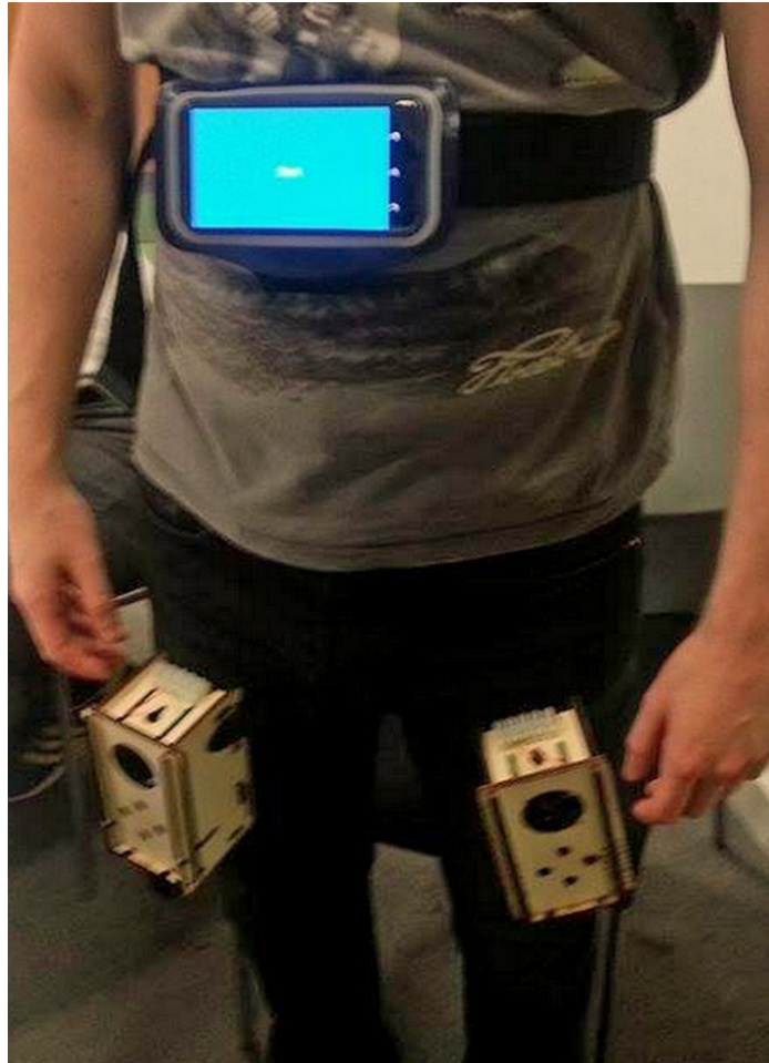
Figure 3: Prototype system showing smartphone on chest mounts and two wireless leg feedback modules

don't understand if they are improving or not when practicing without the aid of a specialist.