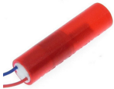
Figure 4: Precision Microdrive Pico Vibe 5mm Vibration Motor (20 mm long, 5.3mm diam)

There is an ever growing range of mobile applications currently available aimed at improving health and fitness of users. A survey by research2guidance showed that the number of mobile health apps on the Apple Store and Google Play app stores surpassed 100,000 in the first quarter of 2014, more than doubling the value recorded in 2011 [7]. This shows a rapid and steady rise in applications and shows that it is an ever growing market. Such applications are wide and varied, many of them are simply for tracking health related values such as weight or calorie intake, e.g. Calorie Counter by MyFitnessPal. Other apps link with 3rd party technologies in order to provide more advanced assistance with fitness, such as the Nike+ Running app. This includes motion tracking technologies allowing mobile phones to track the number of steps a user takes, or the number of exercises a user performs but none that provides haptic feedback for a stroke patient's recovery.