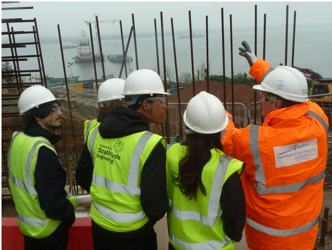
Figure 2. Mentoring (contractor)