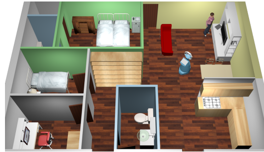
Fig. 2: Simulated environment for the 'Aruba' dataset.

with the same structure as the 'CASAS' apartment was created by taking into account the building plans, see Fig. 2.