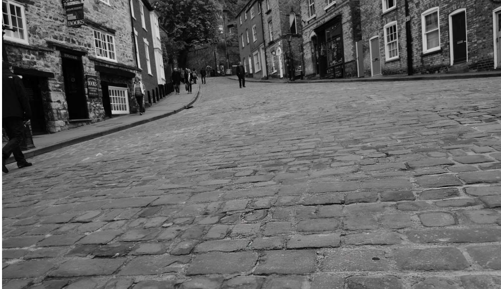
Figure 2: A daunting viewpoint from the bottom of Steep Hill, Lincoln, from a wheelchair user's perspective.