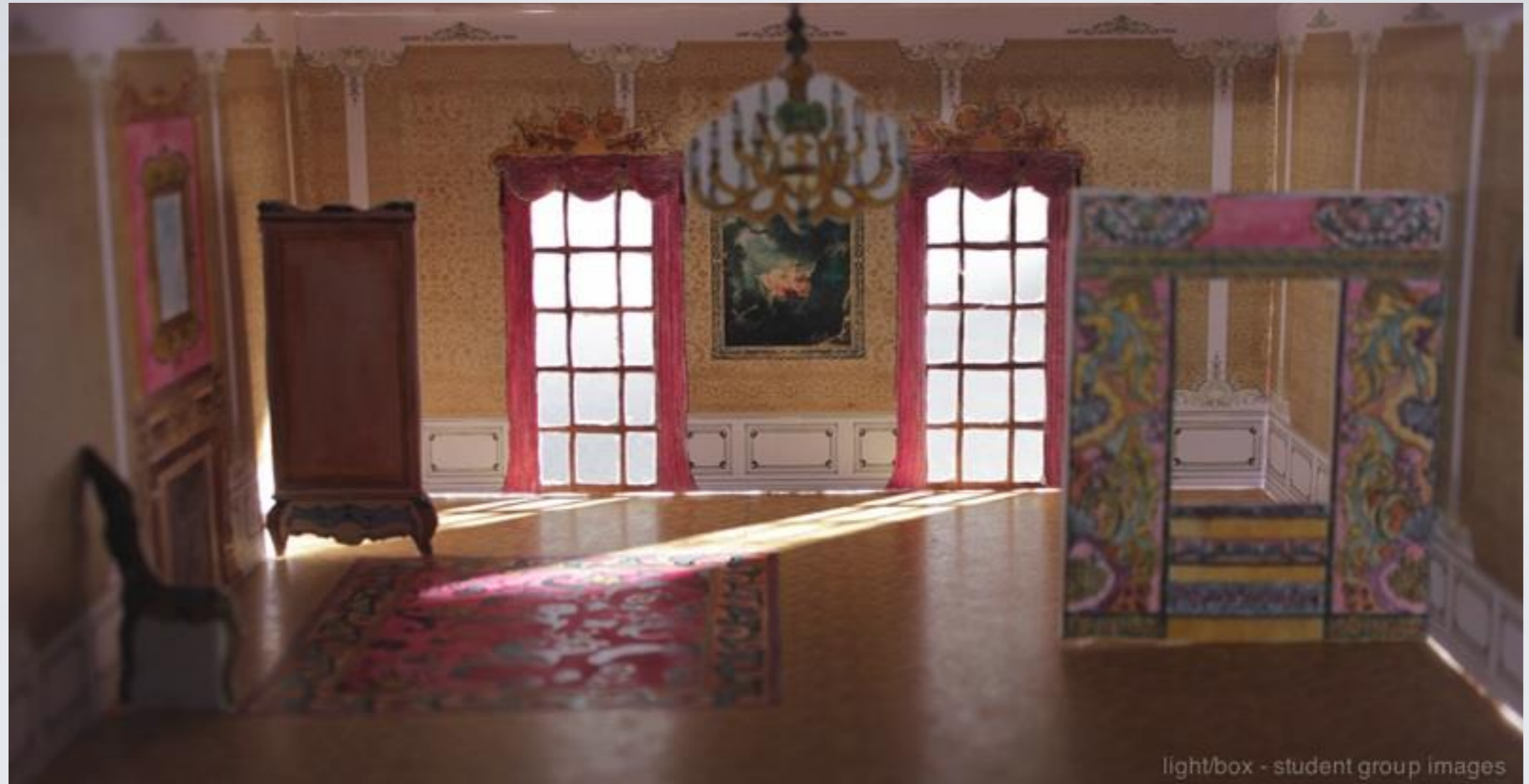
light/box - student group images