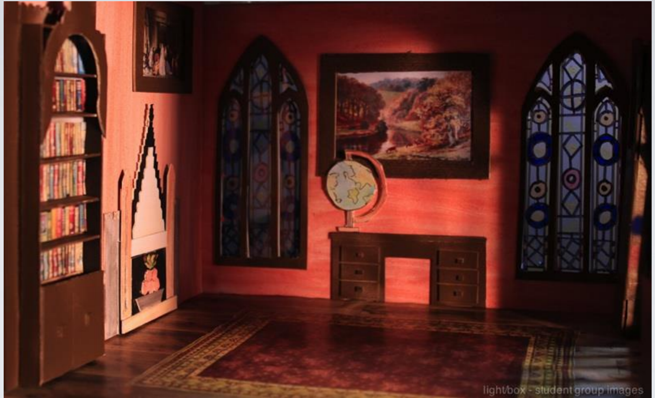
lightbox - student group images