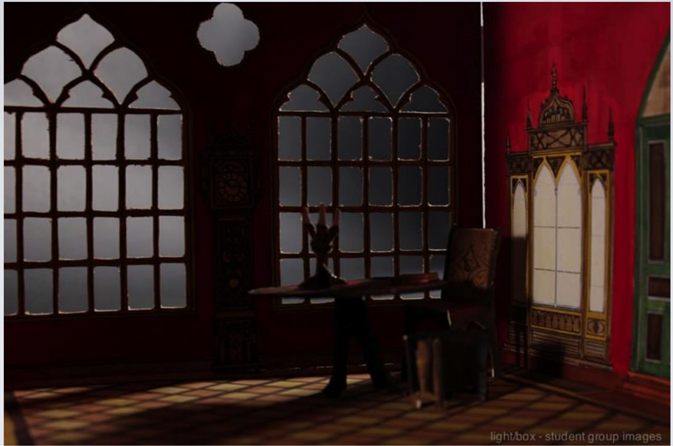
light/box - student group images