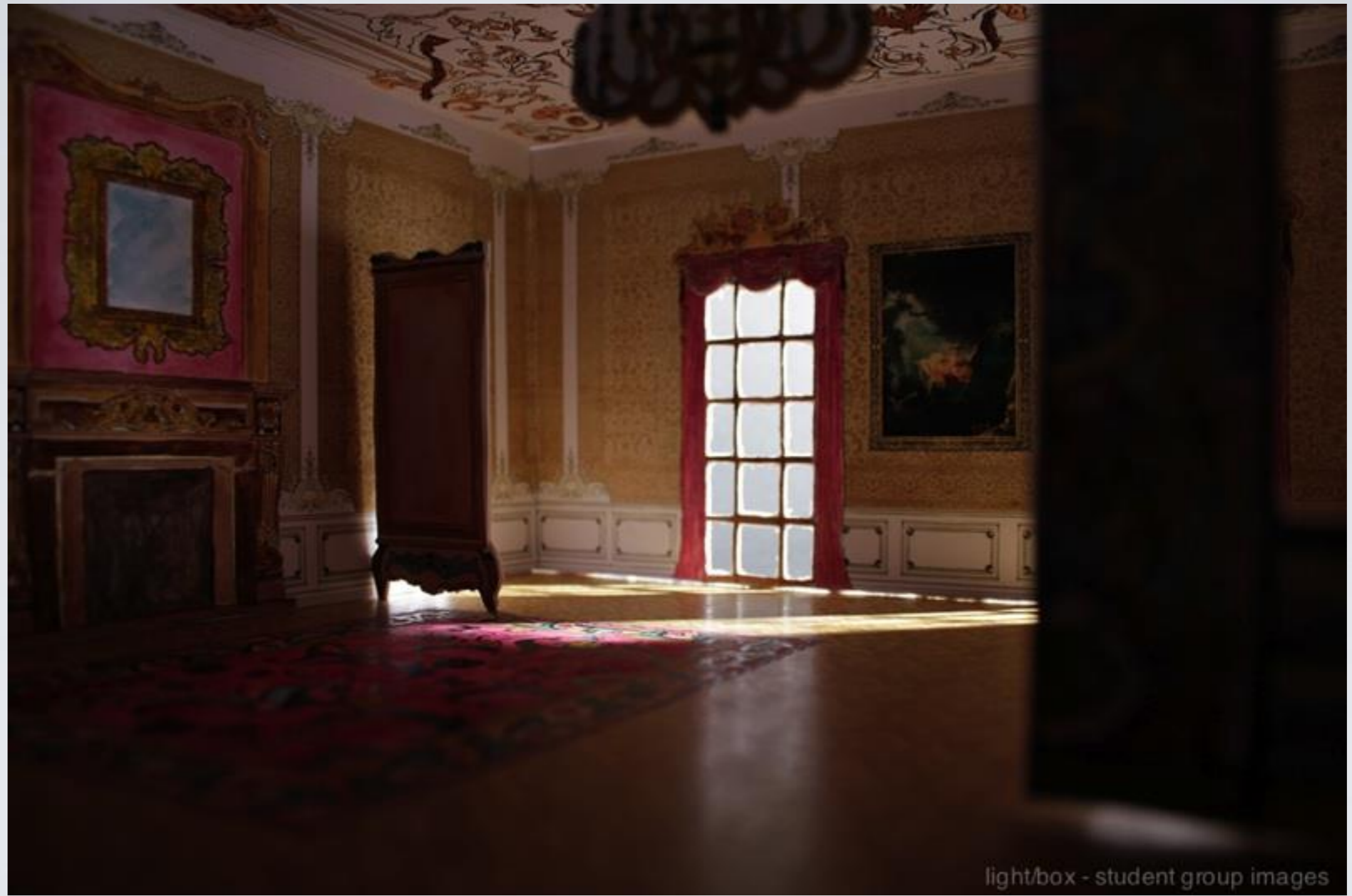
light/box - student group images