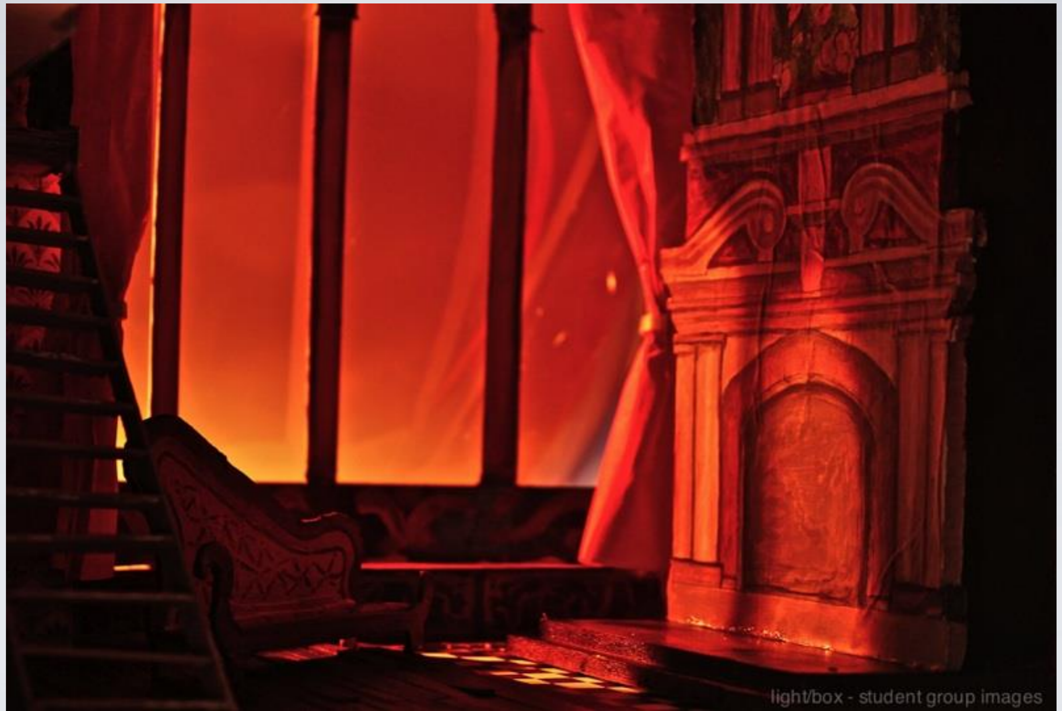
light/box - student group images