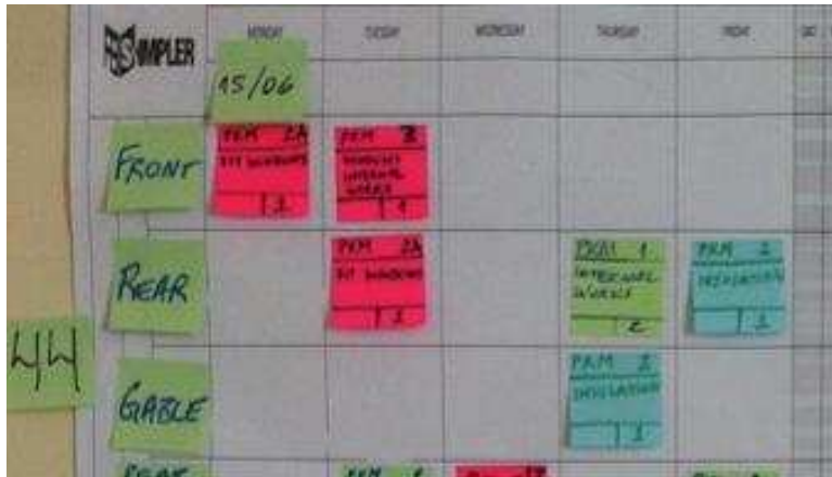
Figure 1: Post-it notes fixed on a location-based chart at the site office (master plan).

As illustrated in the table above, the master plan and phase planning were devised simultaneously due to the characteristics of the project, namely, a retrofit of small houses planned to be executed in short amount of time. In this paper, such plan will be referred as “master plan”. It was devised by the delivery team through the use of post-it notes fixed on a chart at the site office as showed in the following figure.