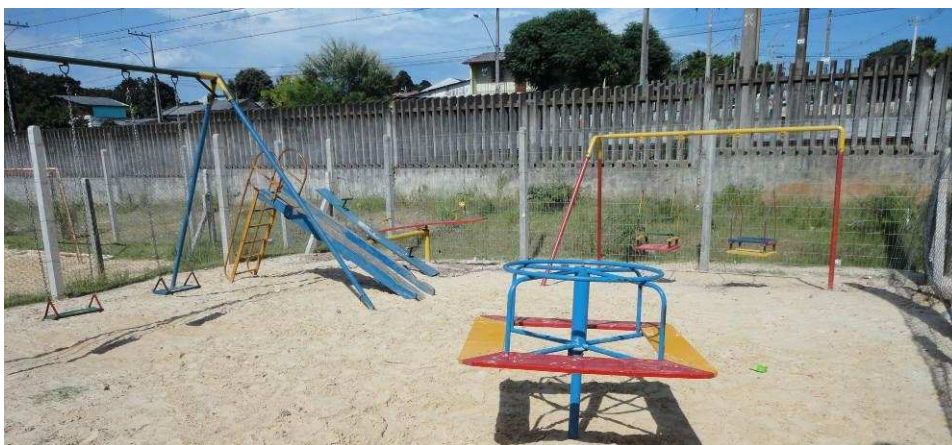
Figure 3 – Playground in São Leopoldo (credits: Marques, 2015)

Regarding to architectural project of community areas, the characteristic most valued by users was the playground. This is justified, in part, by insufficient access of users to public school, and the family profile of beneficiaries - with the frequent presence of families with children. The playground was associated (by users) mainly to two factors: (a) the importance of socialization among children, with regard to their well-being and development; (b) the need for a space for children during parents' working hours.