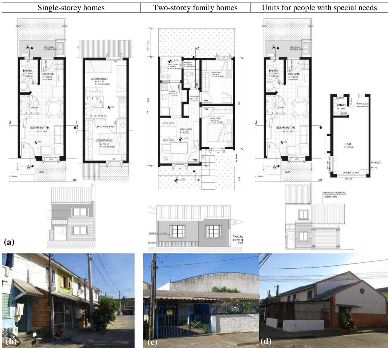
Figure 5 – (a) housing typologies (adapted from Prefeitura Municipal de Porto Alegre, 2013), (b, c and d) Pictures of Housing typologies.