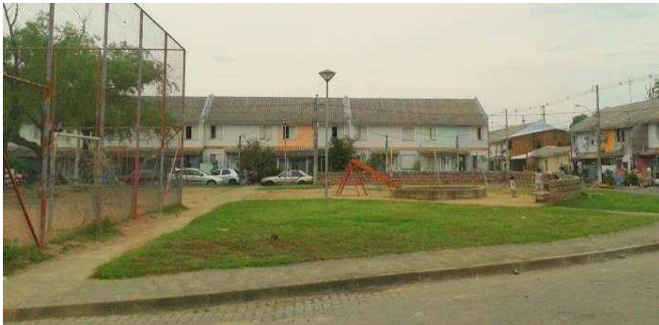
Figure 4 – PIEC Public Space in PIEC (Jardim Navegantes estate)

The technicians claim that while the way that PIEC is managed is being changed, the community areas of housing estates will continue to be public spaces. Once again it was emphasized that public spaces are the responsibility of the Municipal City Hall of Porto Alegre (PMPA), which oversees the management and maintenance of these areas.