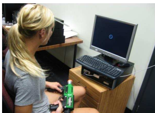
Figure 5. Example of the computer task setup.