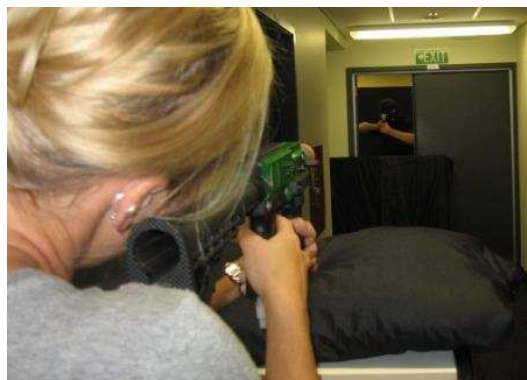
Figure 6. Example of the firearm task setup.