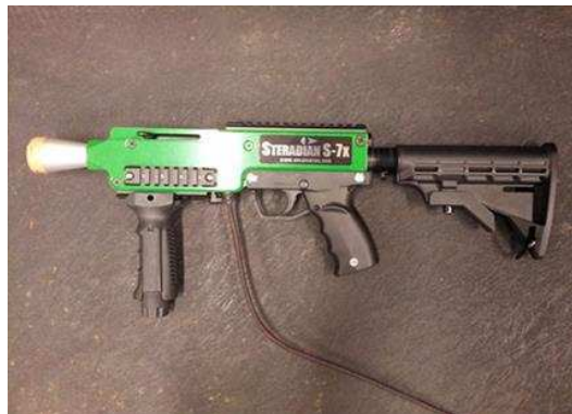
Figure 1. Steradian SX-7 infrared emitter gun.

A modified version of the NASA-Task Load Index (TLX) scale (Hart & Staveland, 1988) was used to gauge subjective workload. This version was determined via prior factor analyses (see Bailey & Thompson, 2001; Ramiro, Valdehita, Lourdes, & Moreno, 2010) and consisted of the following four subscales: mental demand, physical demand, temporal demand, and effort. A global workload measure, which was the combined average of the responses to the four subscales, was also of interest. In addition, to measure their “task focus,” participants answered three self-report questions: one about concentration (How focused on the task were you?), one about task-related thoughts (How much did you think about the task?) and one about task-unrelated thoughts (How much did you think about something other than the task?). The average of these was calculated to give the “task focus” score. Both the NASA-TLX and the Task Focus questions were rated on a 0-100 scale and completed with paper and pencil.