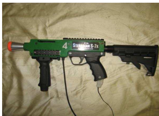
Figure 4. Modified Steradian SX-7 infrared emitter gun containing added micro switch (see below the grip).

Questionnaire. A paper-and-pencil version of the NASA-TLX (Hart & Staveland, 1988) was used to subjectively assess workload. This was the same as the version used in experiment one. It contained four of the NASA-TLX subscales: mental demand, physical demand, temporal demand and effort. A global workload measure, which was simply the average of the four subscales, was also of interest.