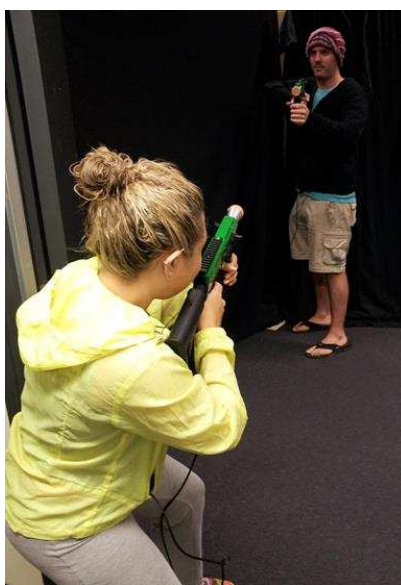
Figure 3. Example of a participant clearing an area.

Participants each completed one practice circuit beforehand. This was used to familiarize them with the task but not used to screen out any participants. Participants completed all three conditions in a within subjects design. For each condition, participants completed 4 full circuits of the floor without stopping. There was a break of approximately 2 min between each condition. During this interval participants had time to recuperate in case they were physically tired from their efforts in the previous condition. During this break the research assistants were free to swap zones with other research assistants. Participants completed the workload and task focus scale items immediately after completing each experimental condition, for a total of 3 times. The order in which participants completed the conditions was counter-balanced. No feedback on their performance was given until the end of the experiment. The experiment took approximately 20 min to complete.