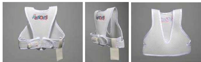
Figure 2 - Final Prototype

initial trials regarding comfort of other products available on the market which informed the design of what has become known as the “Wiggle Bag”. Initially there was some reservation regarding wrapping the central venous line, around the body, yet initial trials showed this to be the most comfortable position for wear. The size of the pocket was initially thought to be important to provide impact protection, but the technical requirements showed this to be lower down on the priority scale. This changed the design from a bulky pocket, to a disposable belt bag that was relatively flexible (Figure 2).